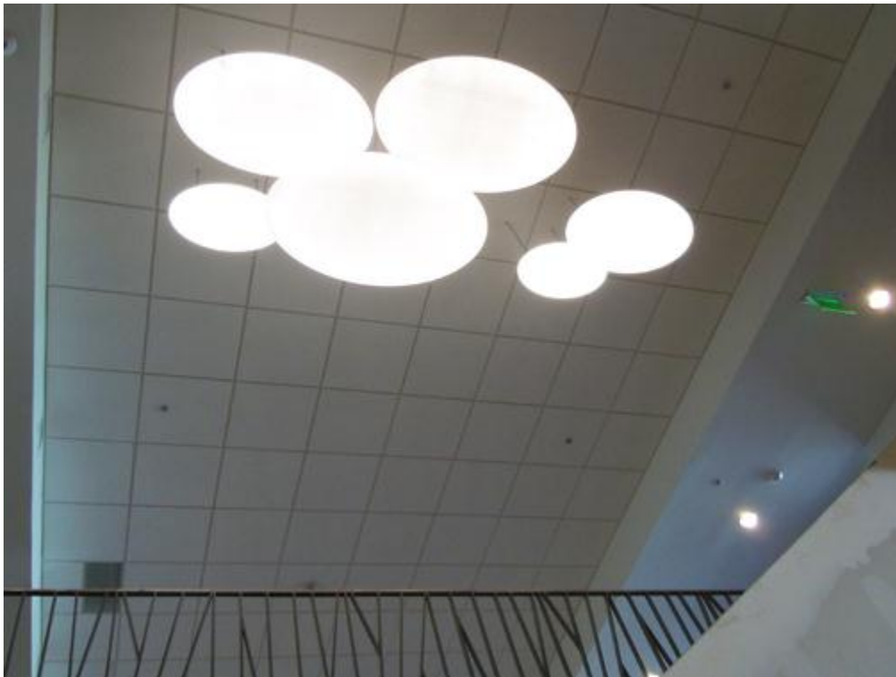
January 24, 2012 Cultural Services Board Meeting