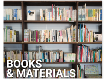
BOOKS & MATERIALS