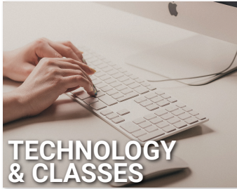
TECHNOLOGY & CLASSES