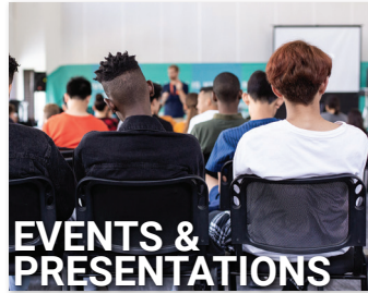
EVENTS & PRESENTATIONS