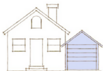
Garage Conversion/ Attached Addition