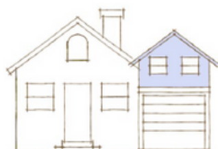
Over the Garage