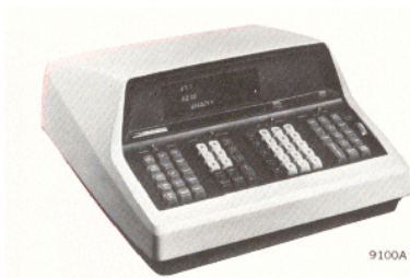
Computing Calculator 9100A

Hewlett Packard Intensive Inventory: Cultural Resource Historians is on track to have the inventory of the 1960s Hewlett Packard Campus completed in July. Staff requests the HPC consider funding storyboards based on the historic/architectural inventory to be displayed in the Hewlett Packard lobby/cafeteria/other as a permanent or temporary exhibit.