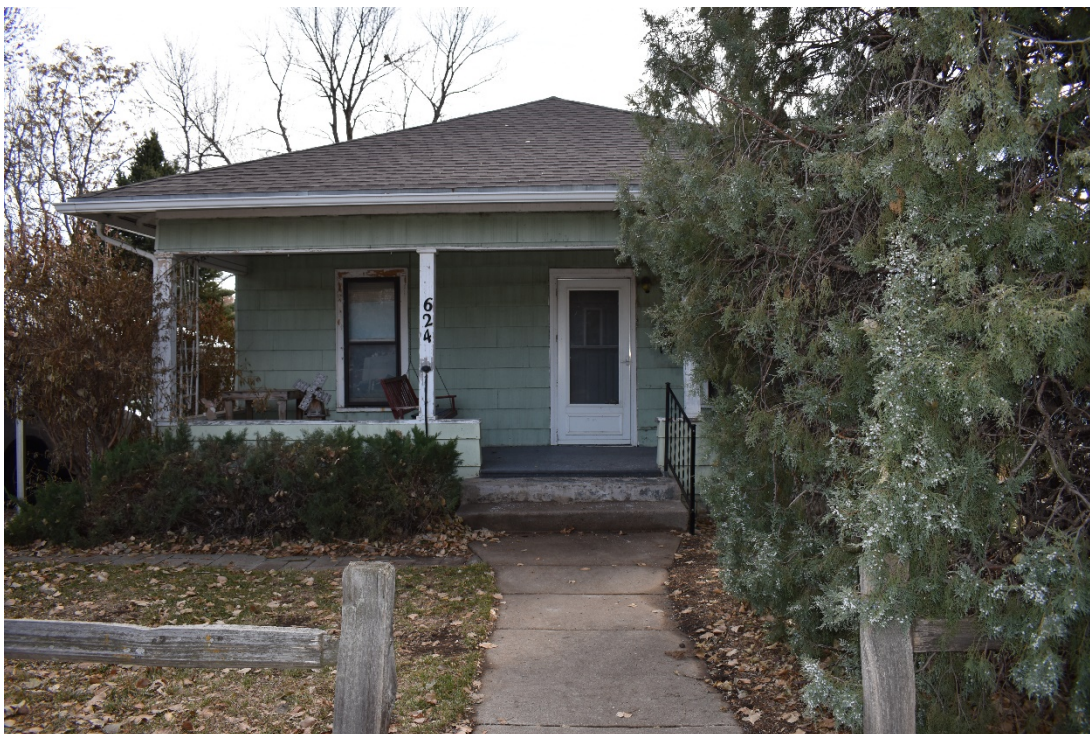
CD 1, Image 117, View to South, of the dwelling