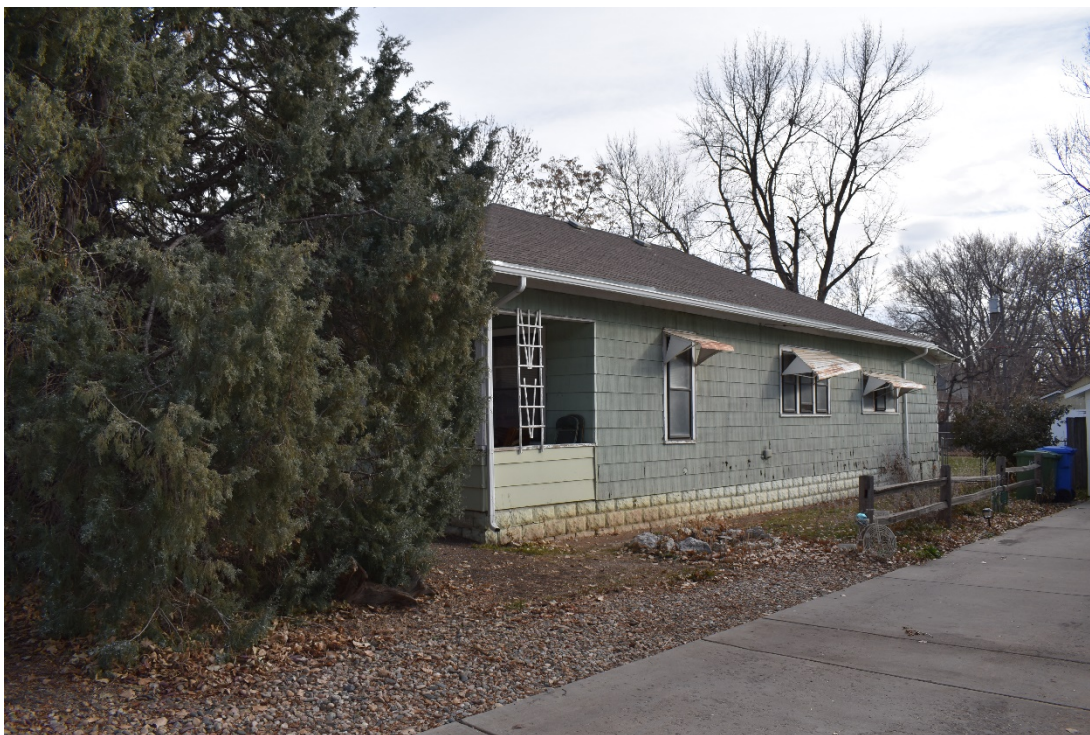
CD 1, Image 118, View to Southeast, of the dwelling