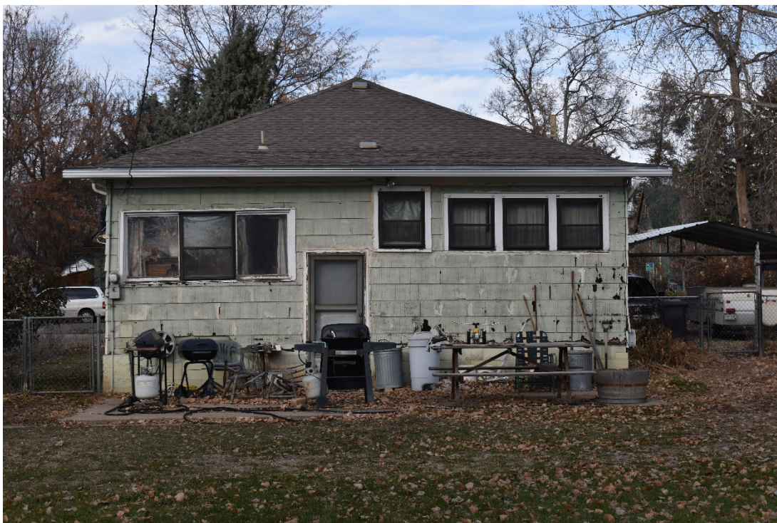
CD 1, Image 121, View to North, of the dwelling