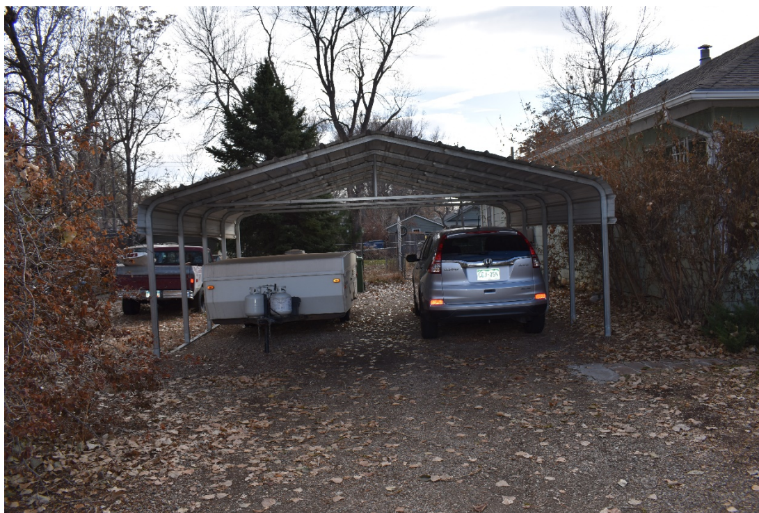
CD 1, Image 120, View to South, of the carport