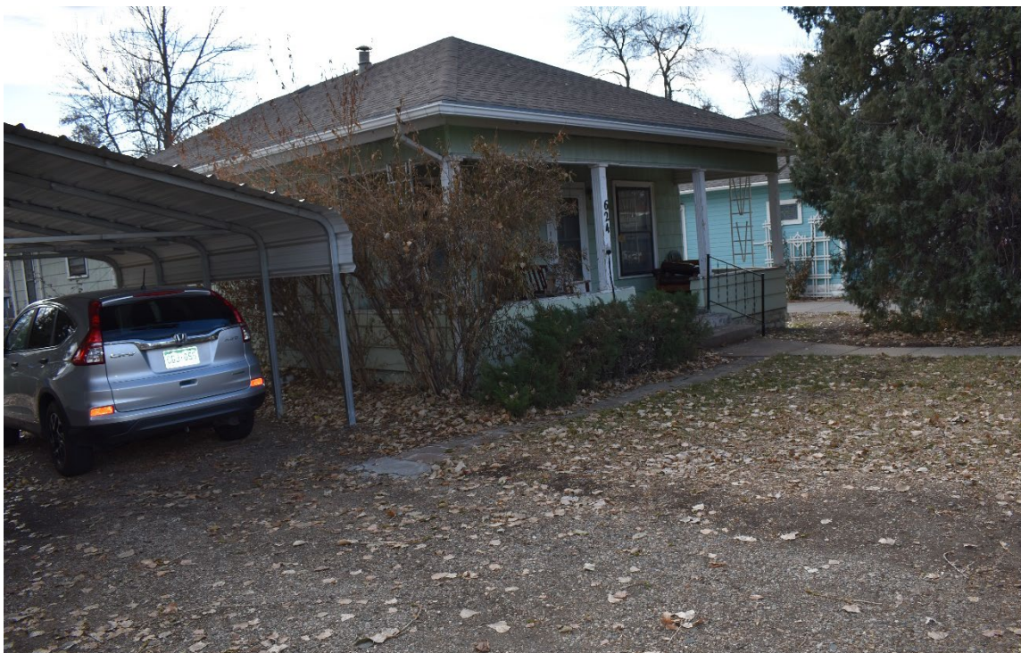
CD 1, Image 119, View to Southwest, of the dwelling and carport