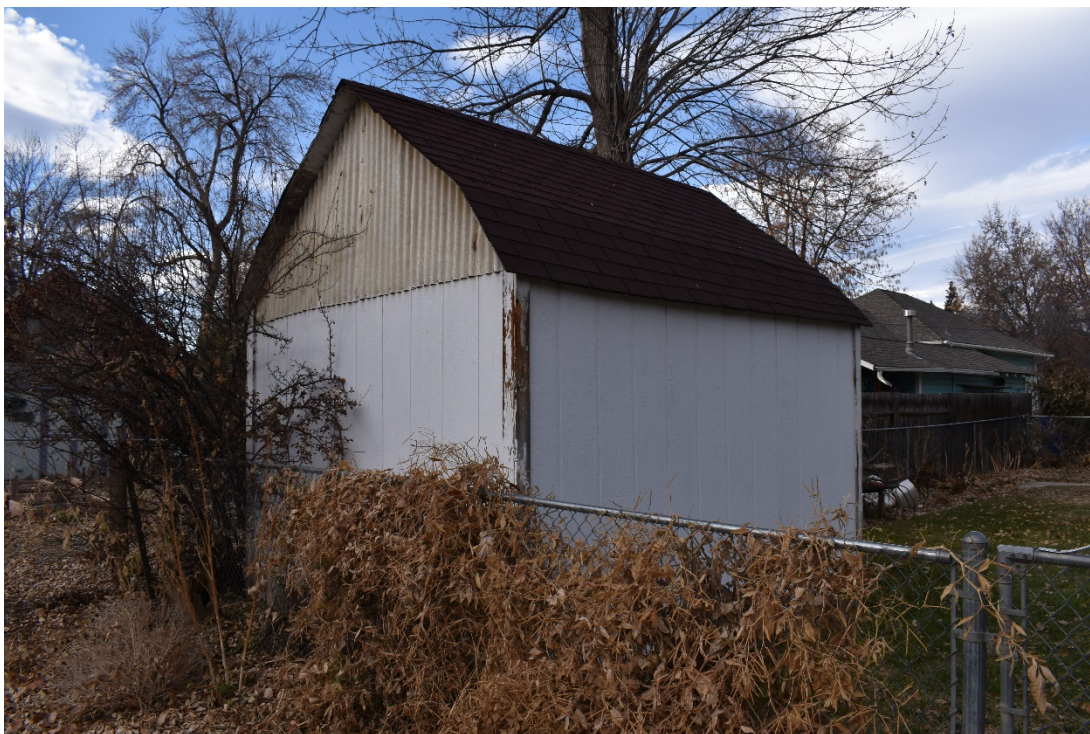
CD 1, Image 122, View to Northwest, of the shed