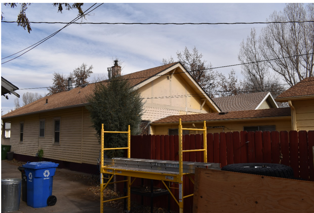
CD 1, Image 92, View to Northeast, of the dwelling and of the connecting addition