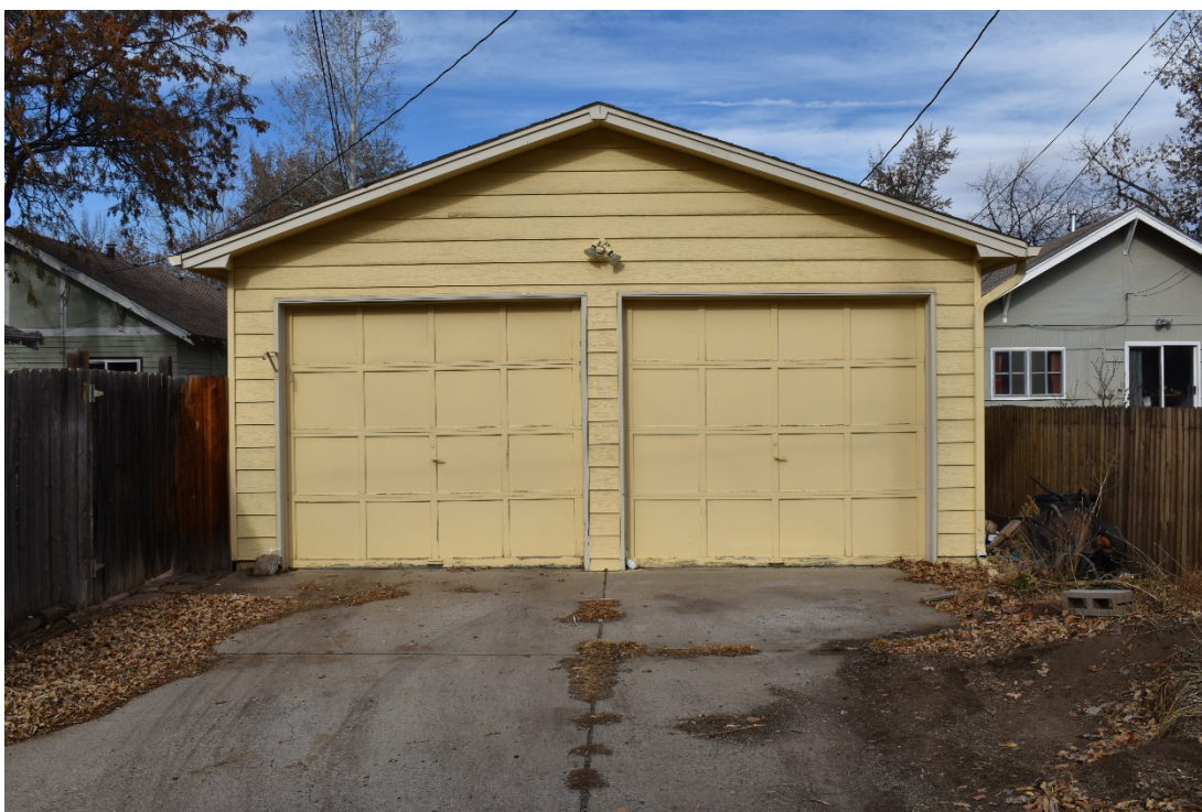
CD 1, Image 94, View to North, of the garage