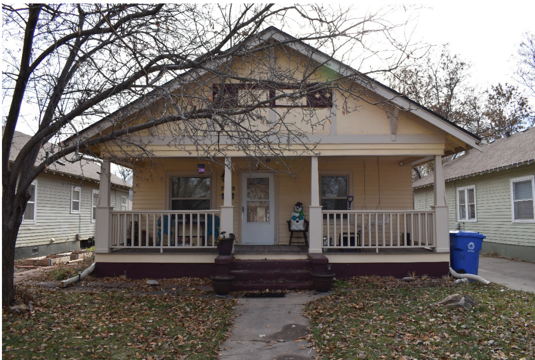
CD 1, Image 89, View to South, of the dwelling