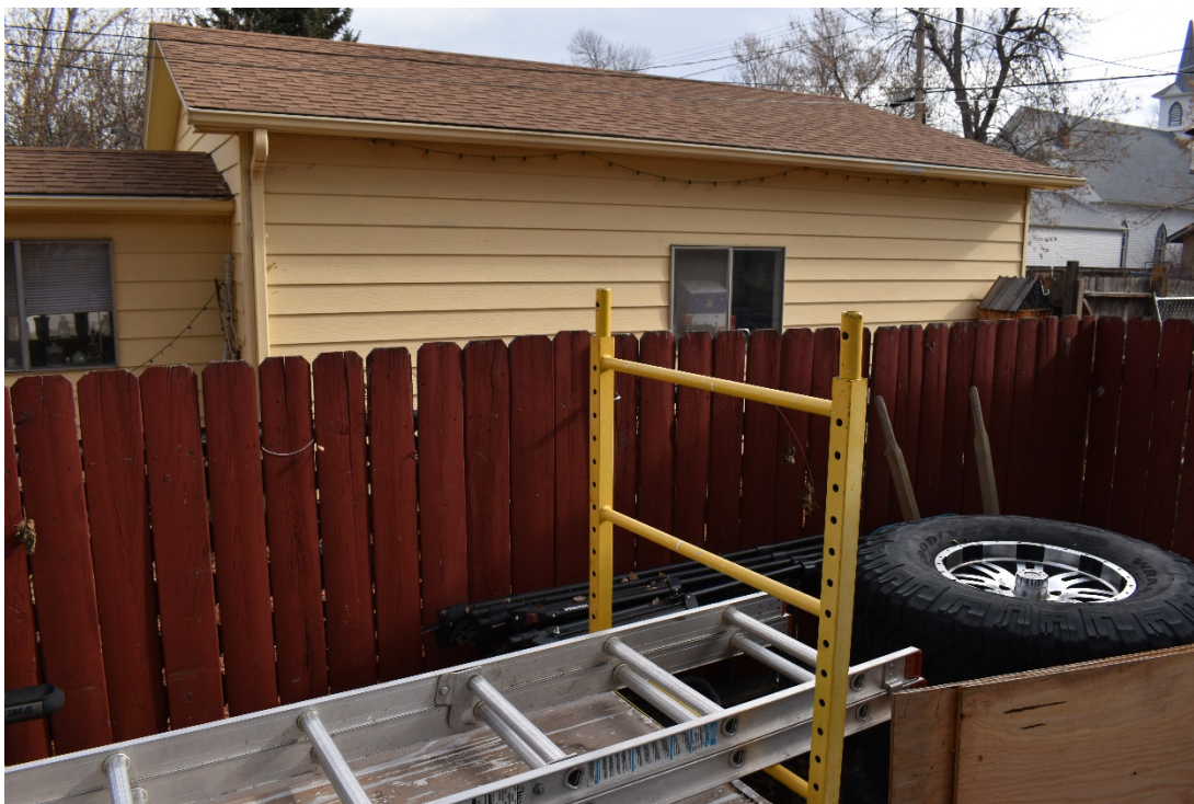
CD 1, Image 93, View to East-Southeast, of the garage and connecting addition