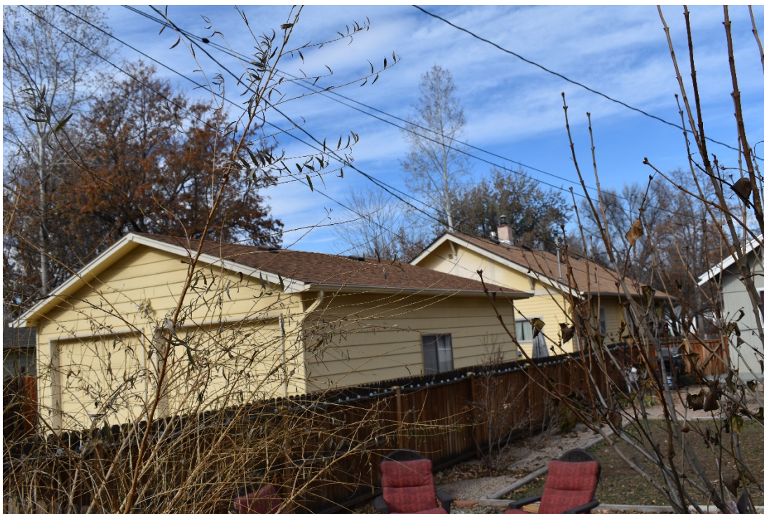
CD 1, Image 95, View to Northwest, of the garage and dwelling