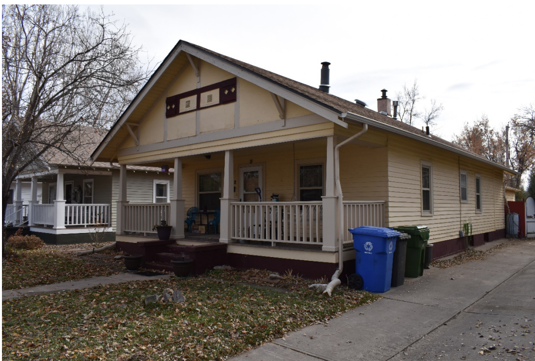
CD 1, Image 90, View to Southeast, of the dwelling