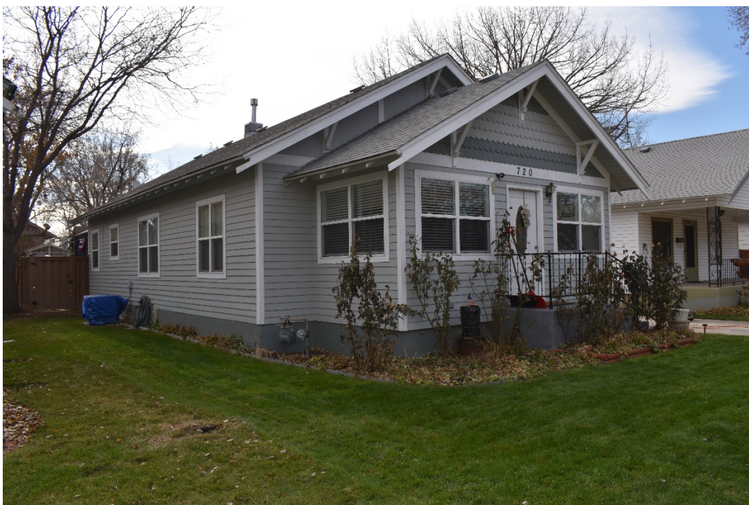
CD 1, Image 76, View to Southwest, of the dwelling