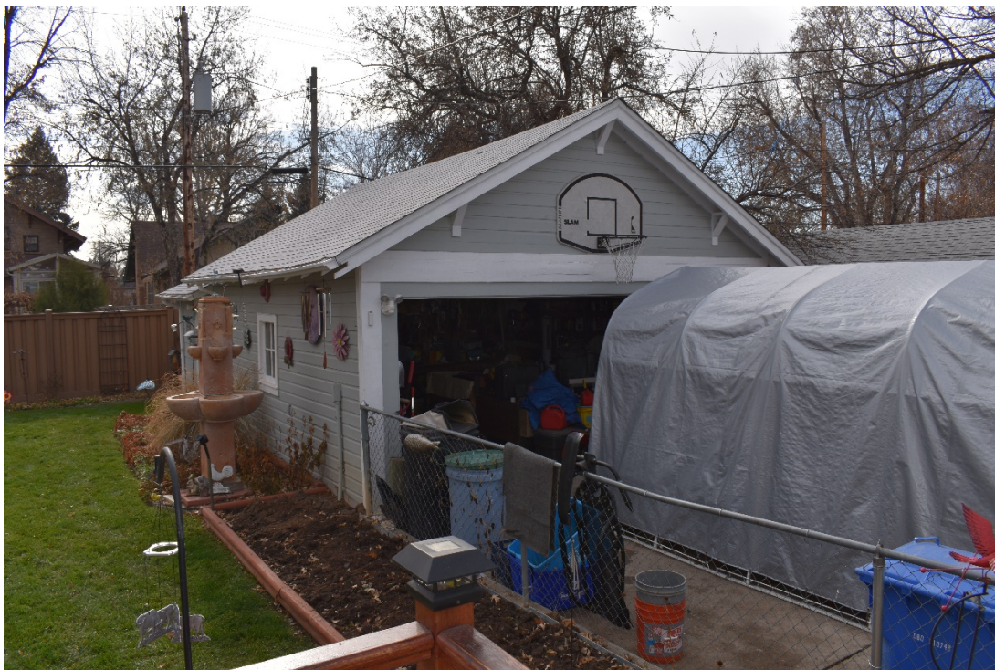
CD 1, Image 79, View to Southwest, of the garage