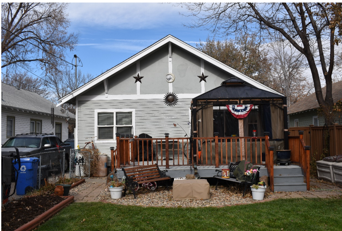
CD 1, Image 78, View to North, of the dwelling