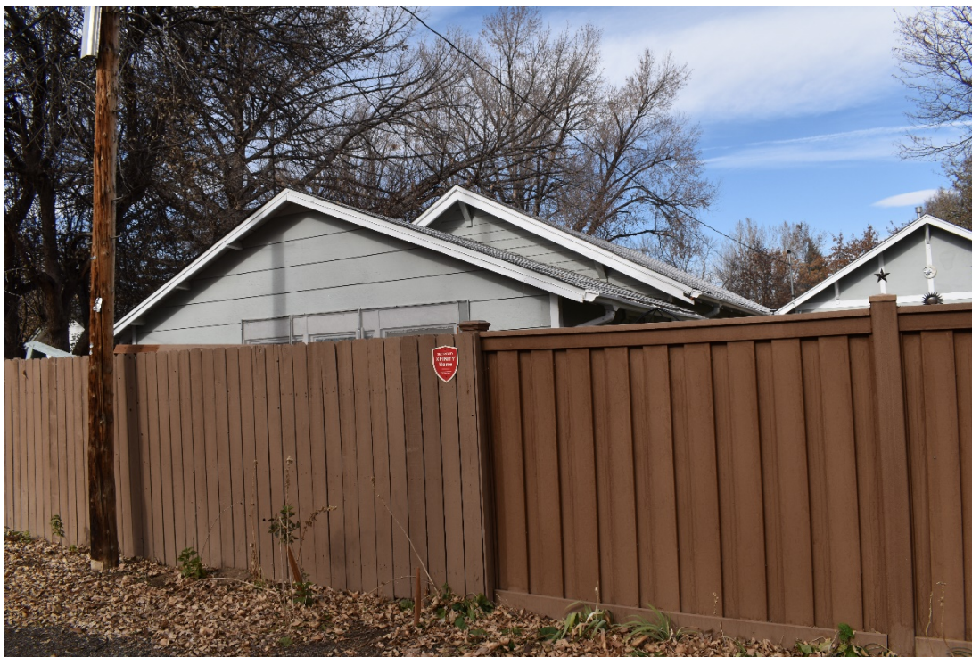
CD 1, Image 80, View to Northwest, of the garage and the back fence