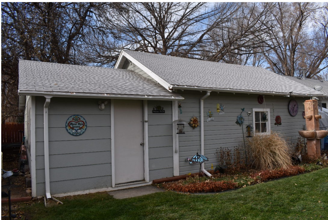
CD 1, Image 1, View to Northwest, of the garage