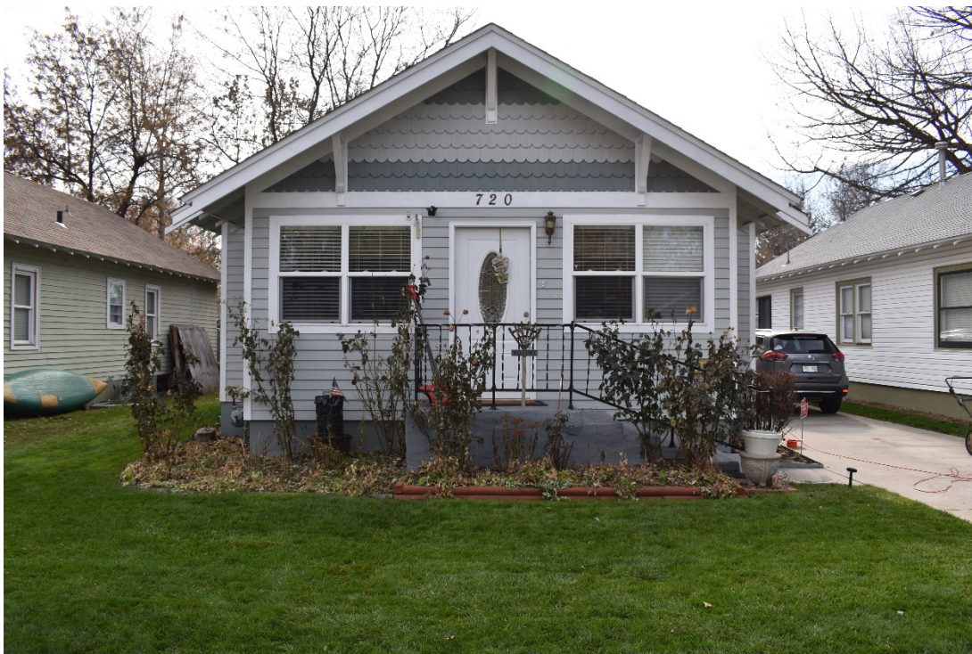
CD 1, Image 75, View to South, of the dwelling