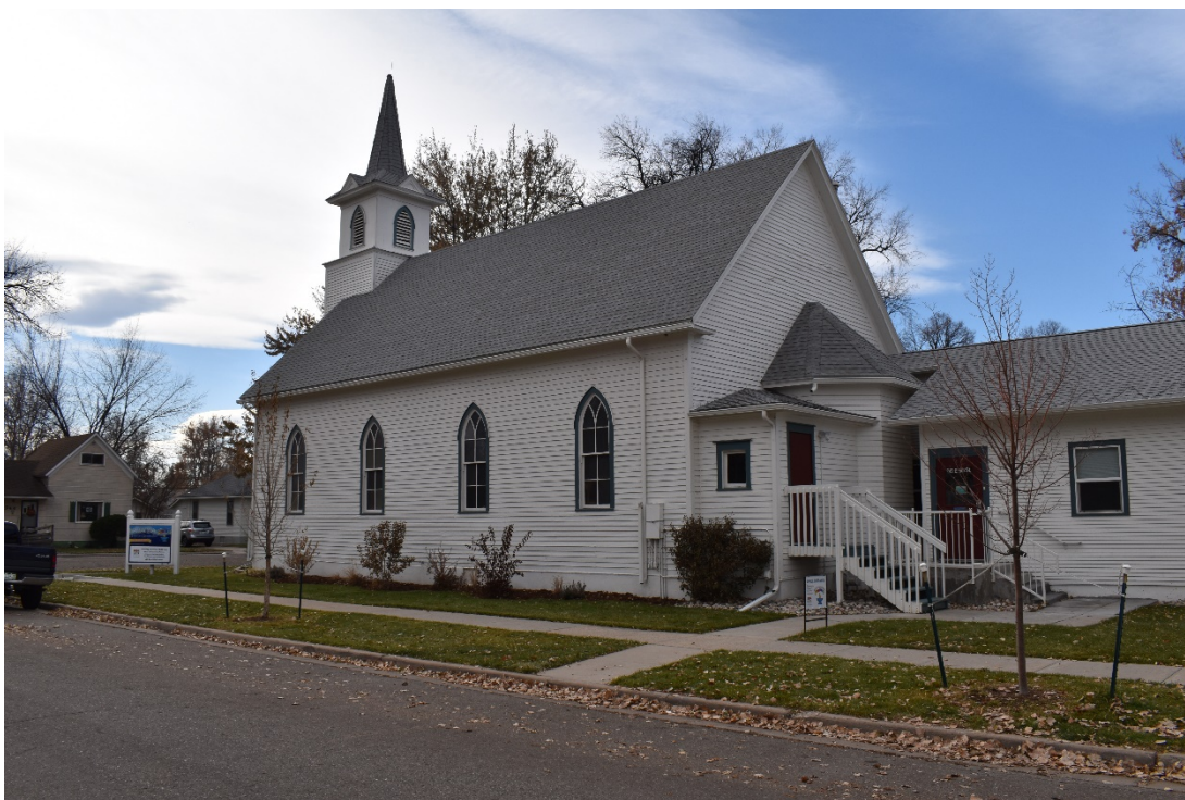
CD 1, Image 49, View to Southwest