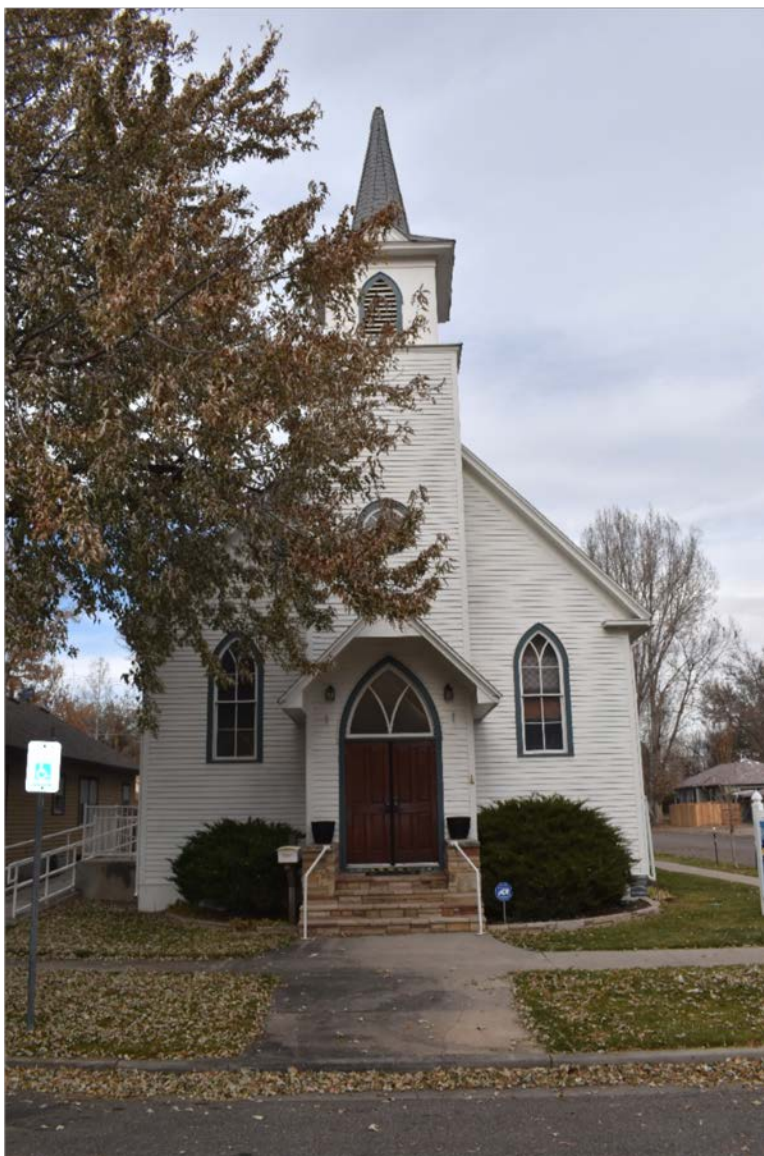
CD 1, Image 50, View to North