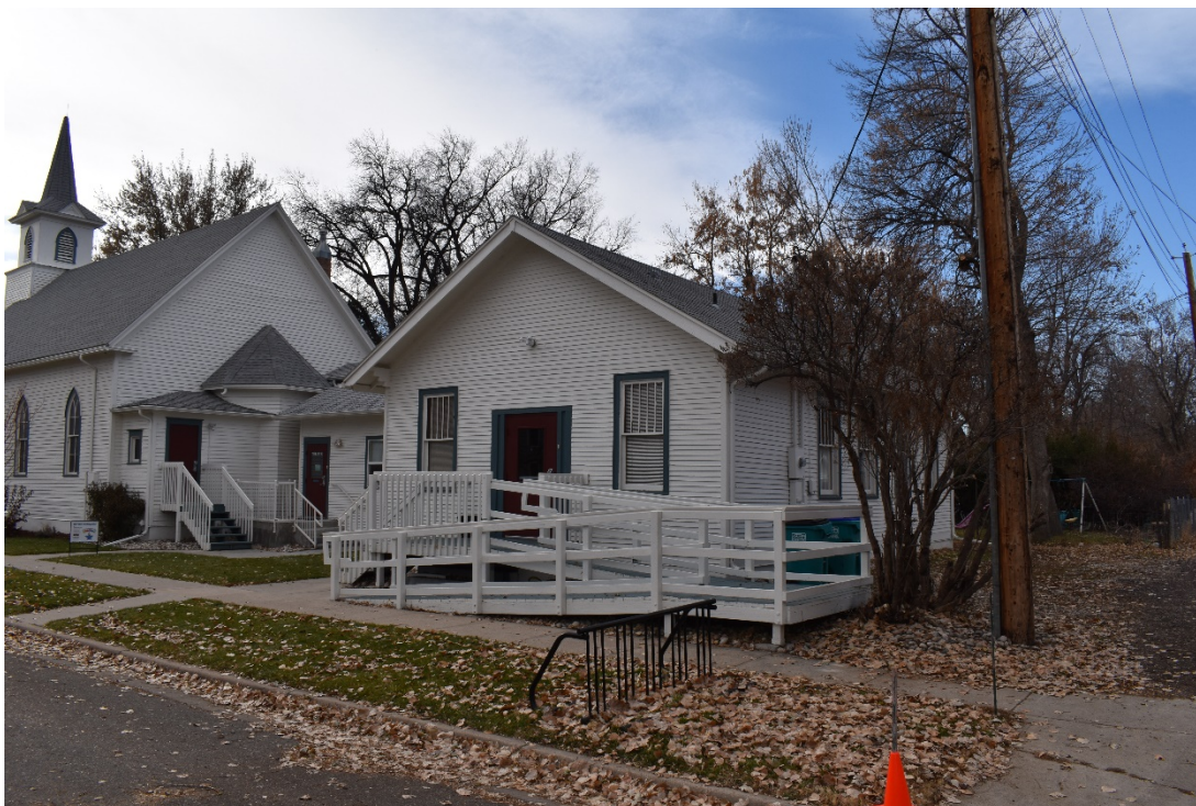
CD 1, Image 53, View to Southwest