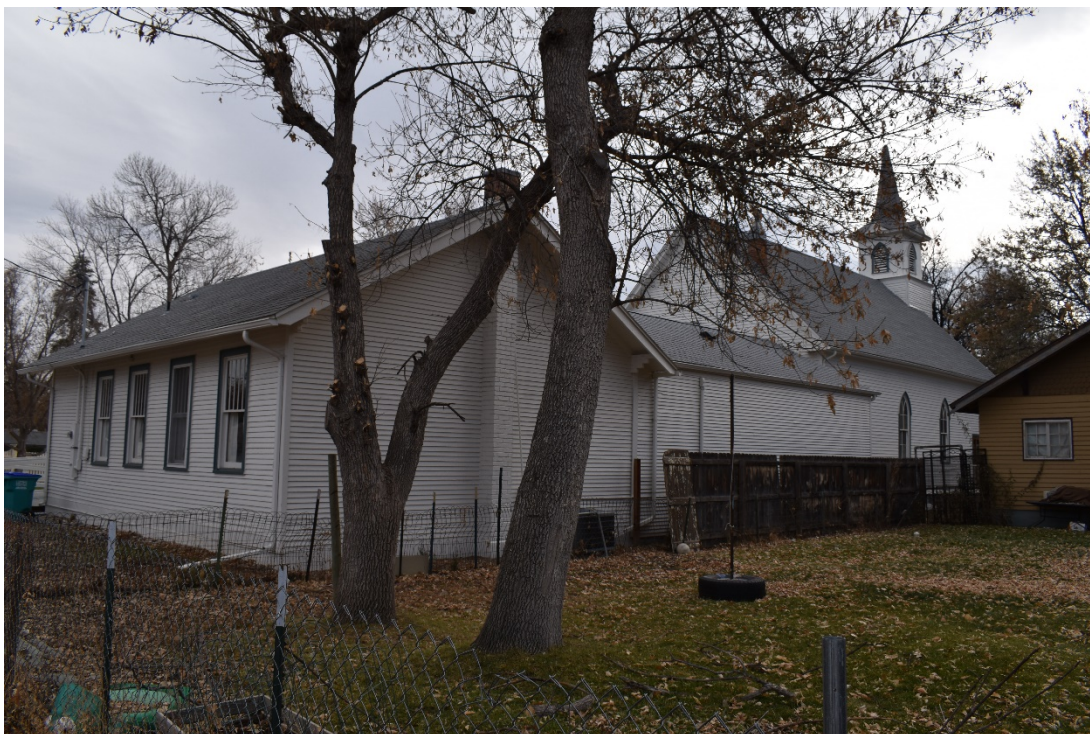
CD 1, Image 55, View to Southeast