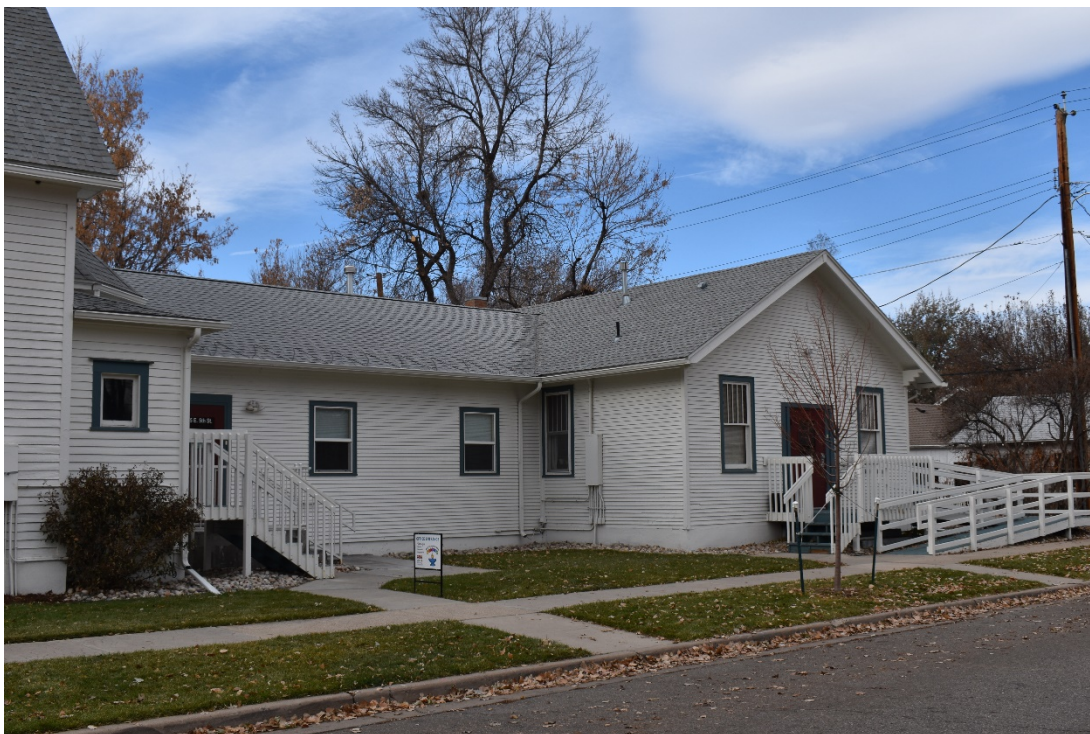
CD 1, Image 51, View to Northwest