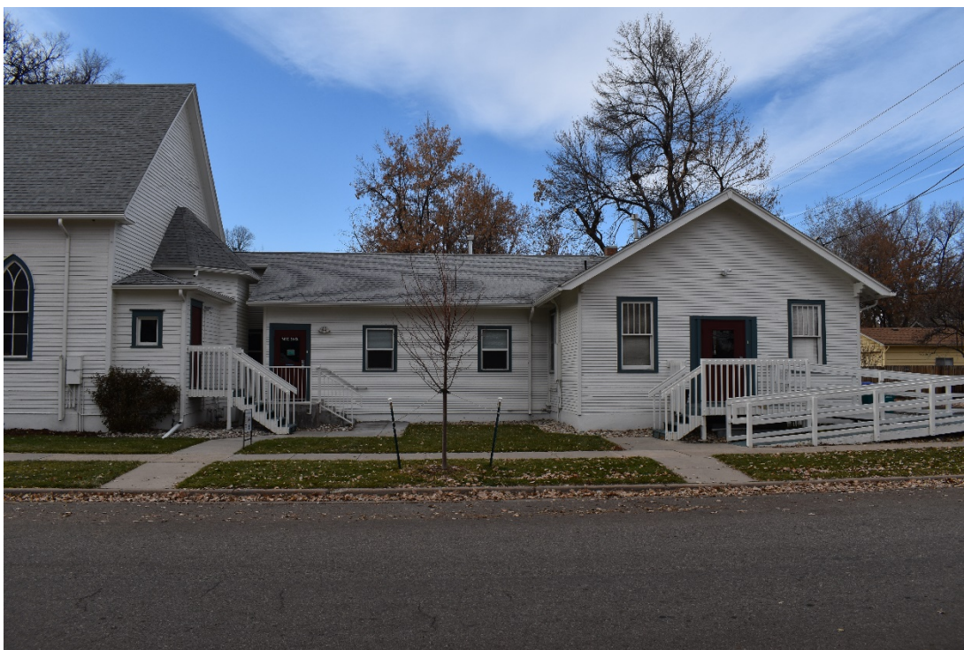
CD 1, Image 52, View to West