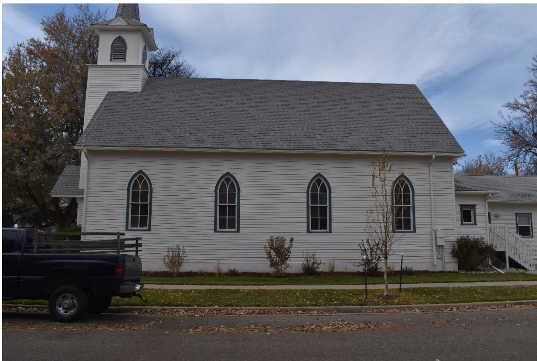
CD 1, Image 46, View to Northwest