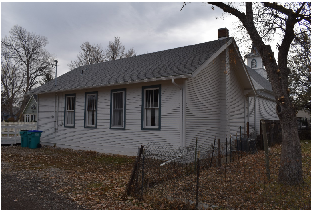
CD 1, Image 54, View to Southeast