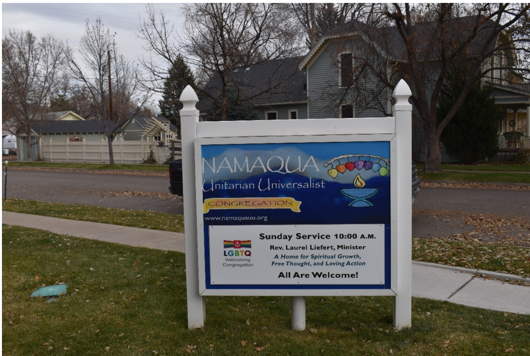
CD 1, Image 56, View to Northeast, of the sign near the front southeast corner of the property