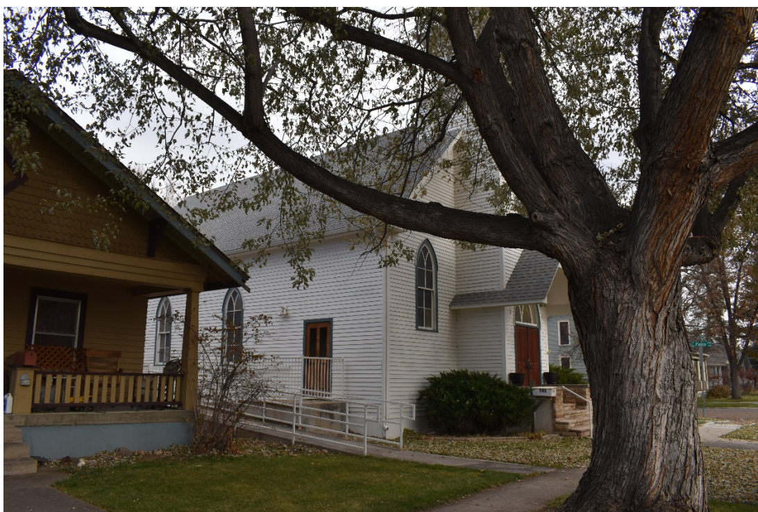
CD 1, Image 47, View to Northeast