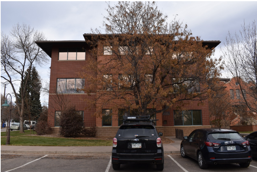
CD 1, Image 34, View to North, primarily of the south wall of the Municipal Annex