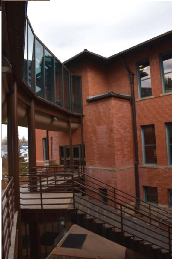
CD 1, Image 27, View to Northeast, of the Municipal Building's west wall and of the walkway area