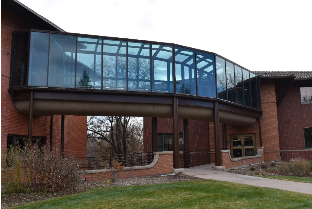
CD 1, Image 31, View to Southeast, of the walkway area between the Municipal Building and the Municipal Annex