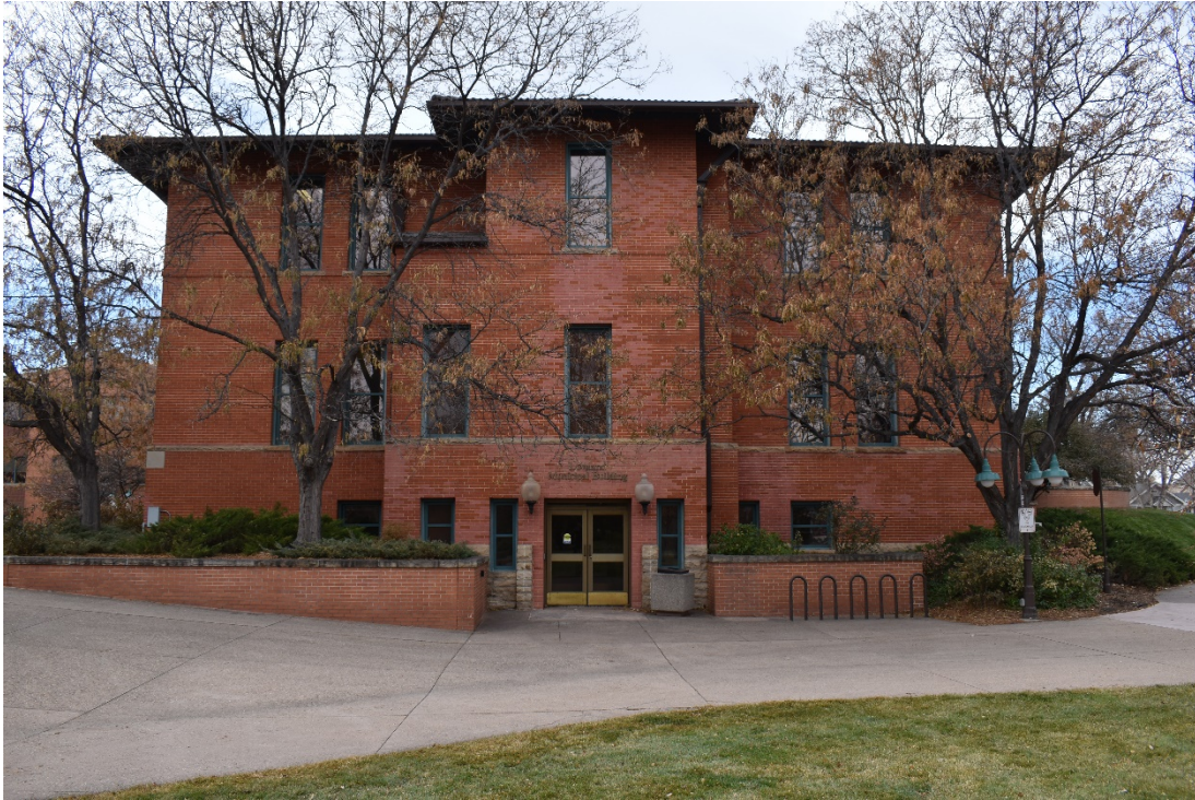
CD 1, Image 29, View to West, of the Municipal Building's east wall