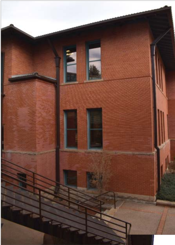
CD 1, Image 26, View to Northeast, of the south end of the Municipal Building's west wall