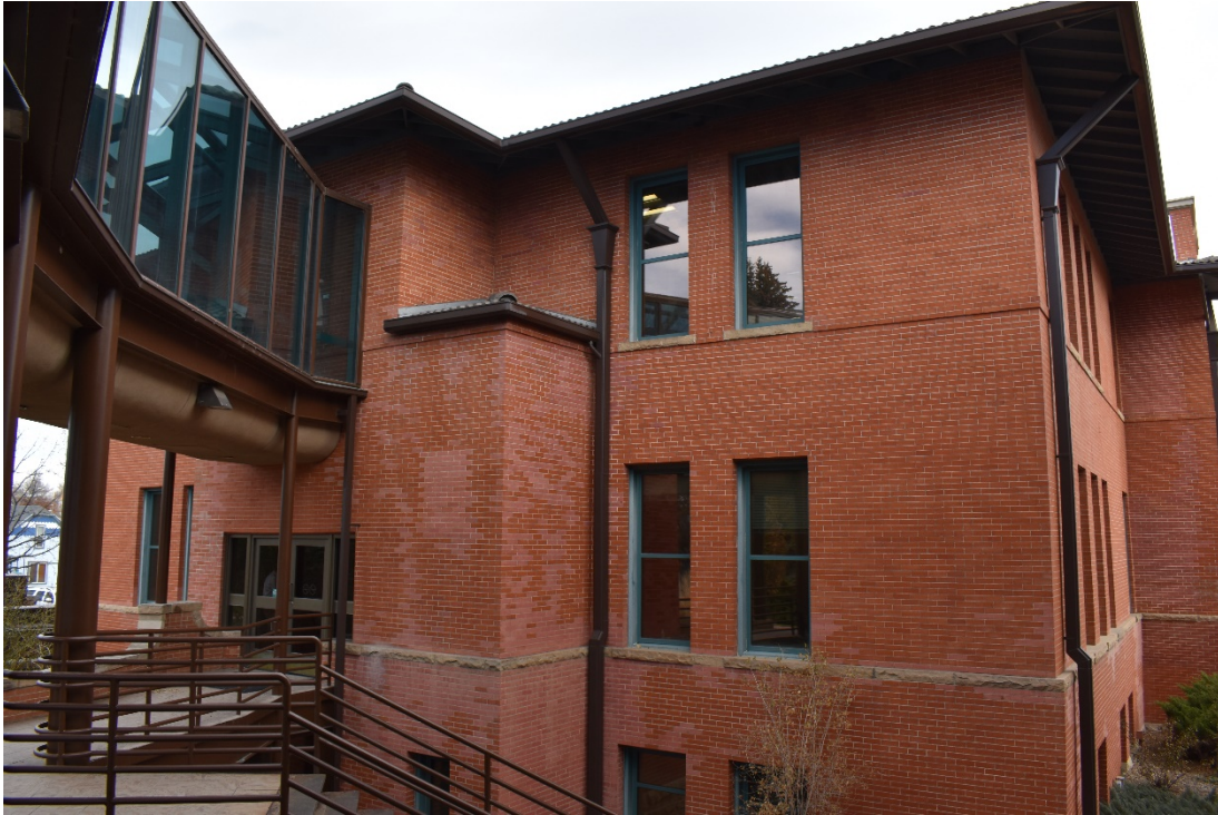
CD 1, Image 25, View to Northeast, primarily of the Municipal Building's west wall and of the connecting walkway