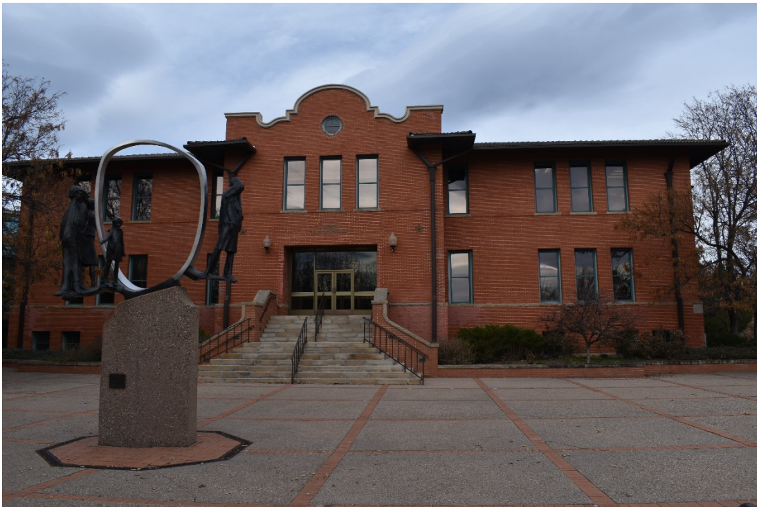
CD 1, Image 28, View to North, of the Municipal Building's south wall