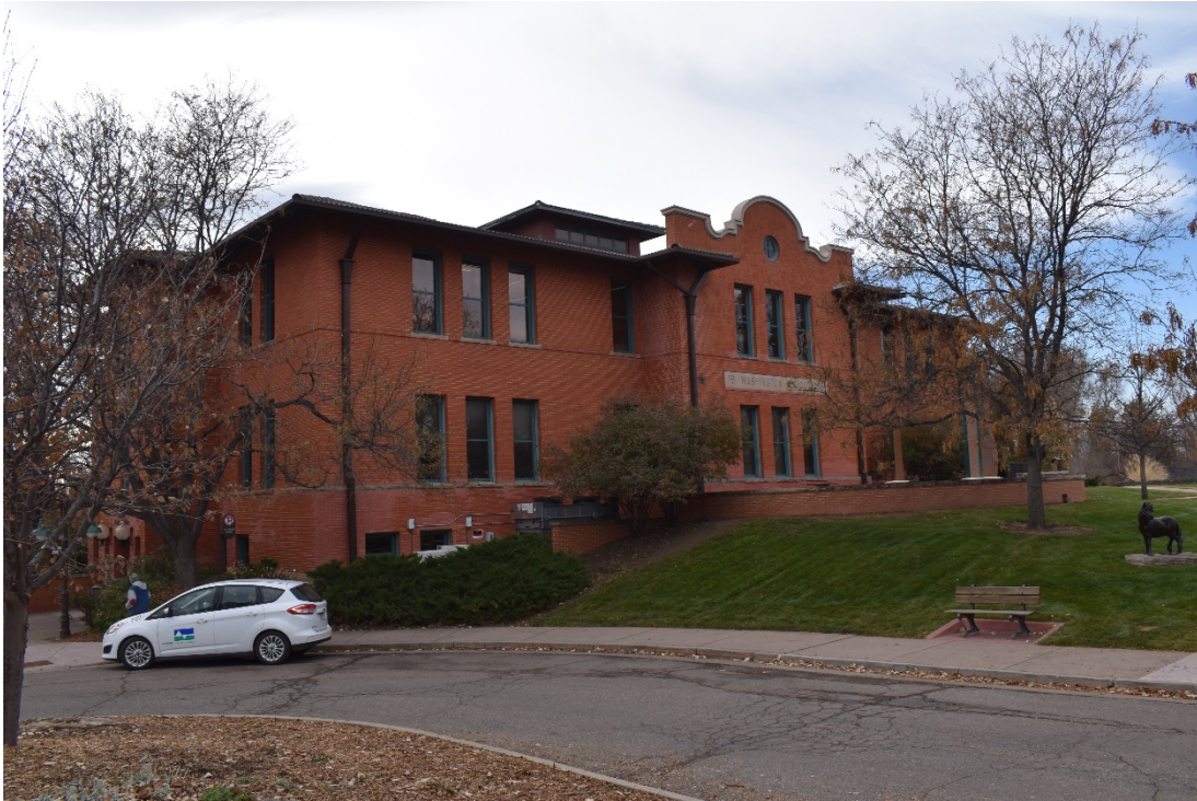
CD 1, Image 21, View to Southwest, of the Municipal Building's east and north walls