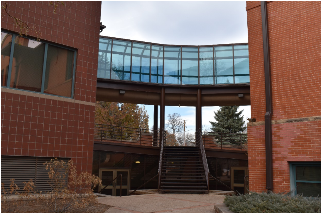
CD 1, Image 36, View to Northwest, of the walkway area