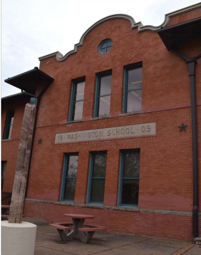
CD 1, Image 30, View to Southeast, of the center section of the Municipal Building's north wall