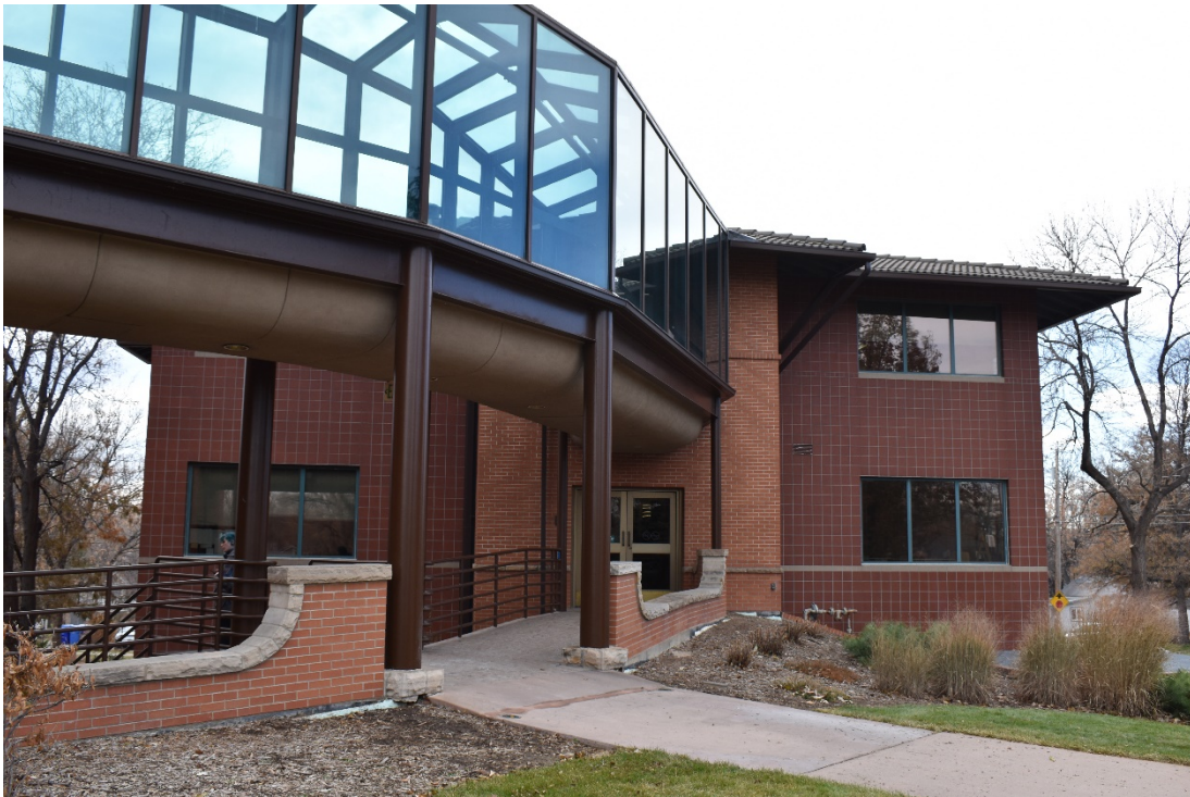
CD 1, Image 32, View to South, of the north wall of the Municipal Annex and of the walkway area