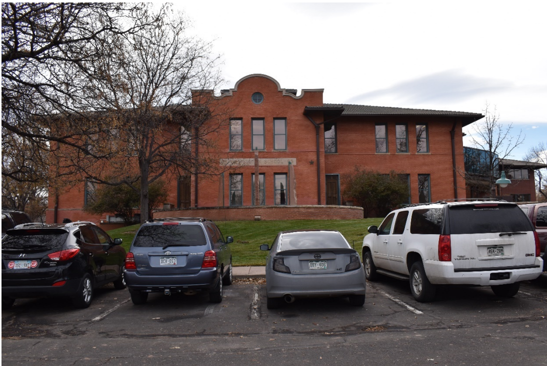
CD 1, Image 22, View to South, of the Municipal Building's north wall