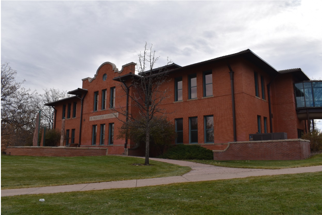
CD 1, Image 23, View to Southeast of the Municipal Building's north and west walls