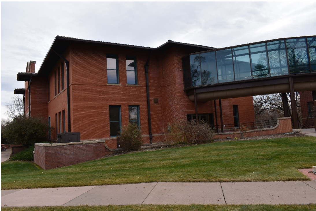
CD 1, Image 24, View to Southeast, primarily of the Municipal Building's west wall and of the connecting walkway