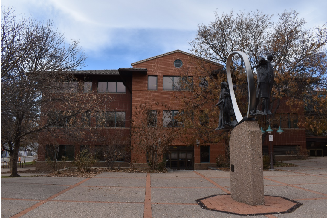
CD 1, Image 35, View to West, of the east wall of the Municipal Annex, and of the "Twist of Fate" sculpture in the plaza