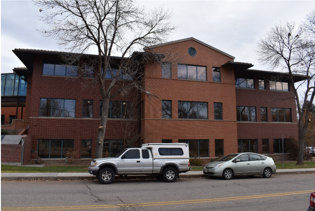
CD 1, Image 33, View to East, of the west wall of the Municipal Annex