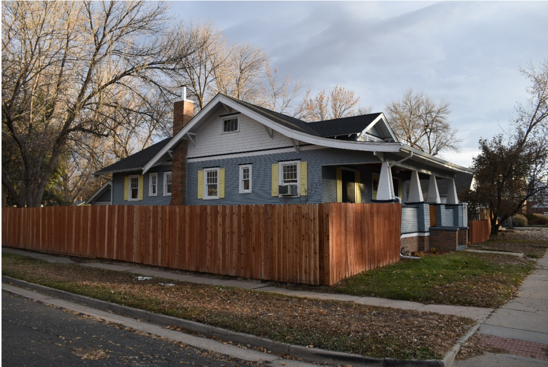
CD 1, Image 162, View to Southeast, of the dwelling