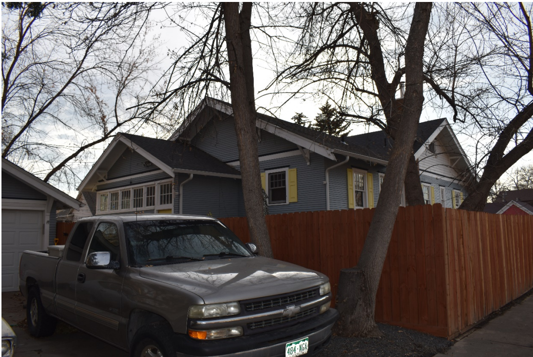
CD 1, Image 163, View to Southwest, primarily of the dwelling