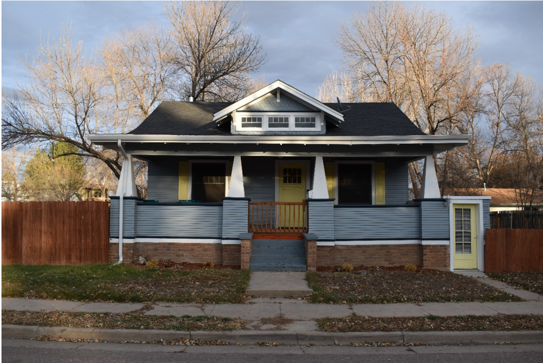
CD 1, Image 160, View to East, of the dwelling