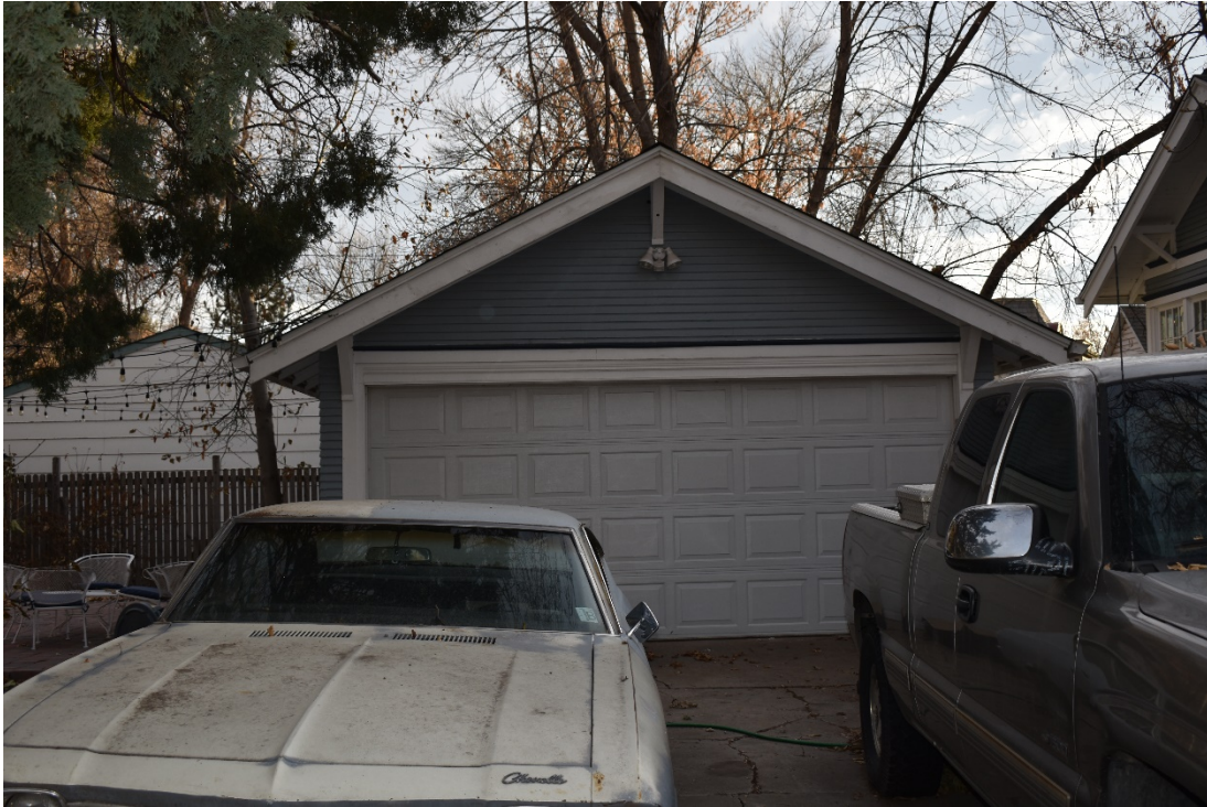
CD 1, Image 164, View to South, of the garage