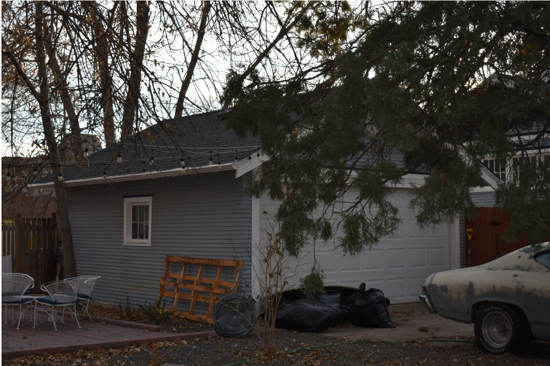
CD 1, Image 165, View to Southwest, of the garage