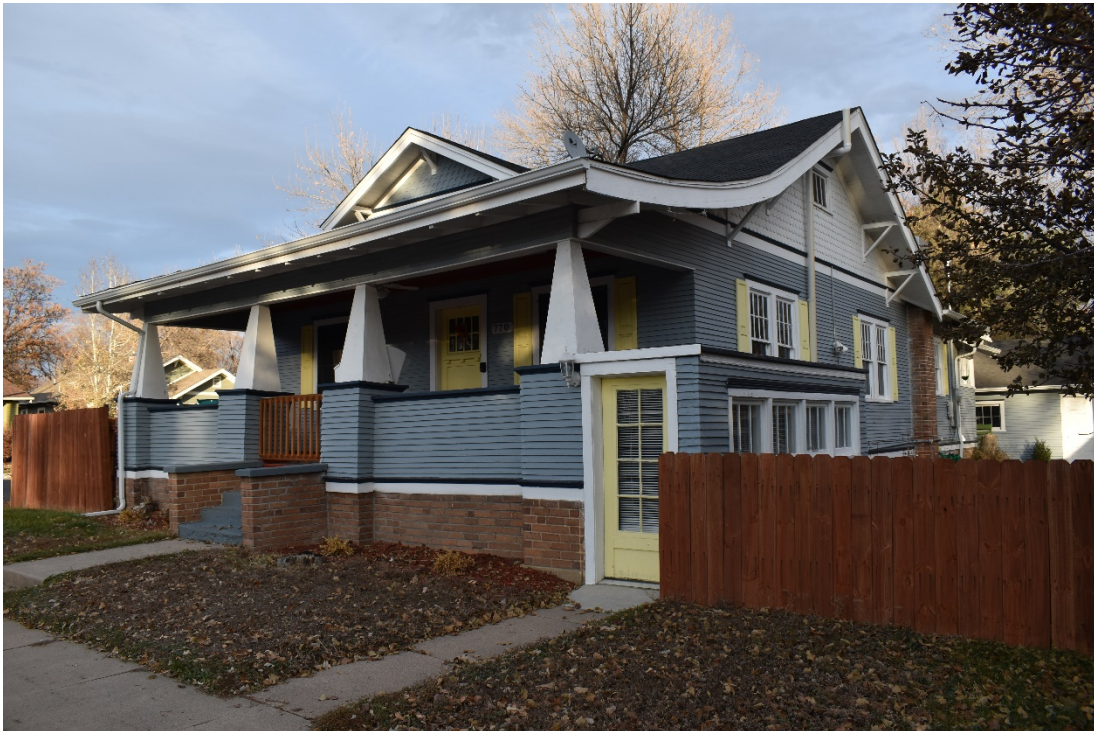
CD 1, Image 161, View to Northeast, of the dwelling