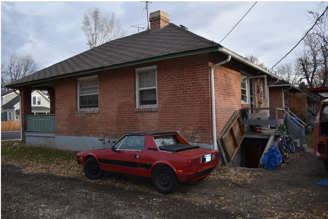
CD 1, Image 159, View to Southeast