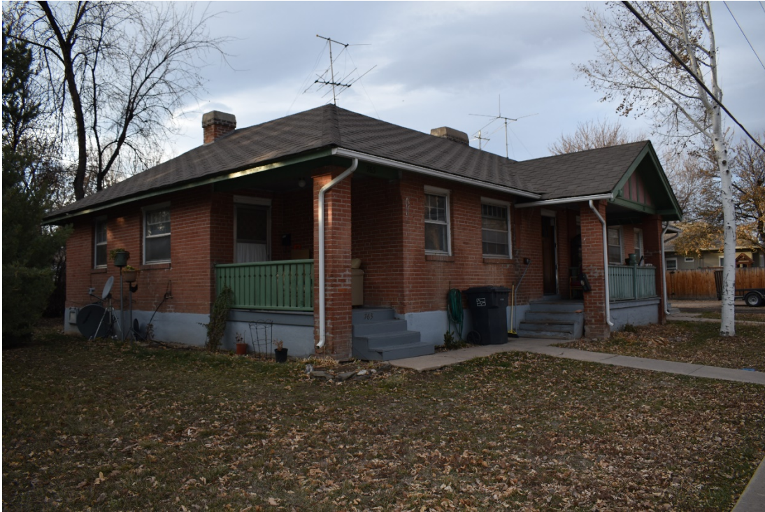
CD 1, Image 158, View to Northwest