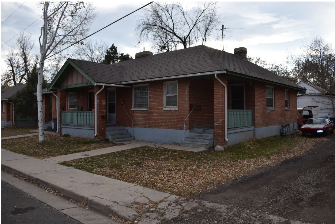
CD 1, Image 157, View to Southwest