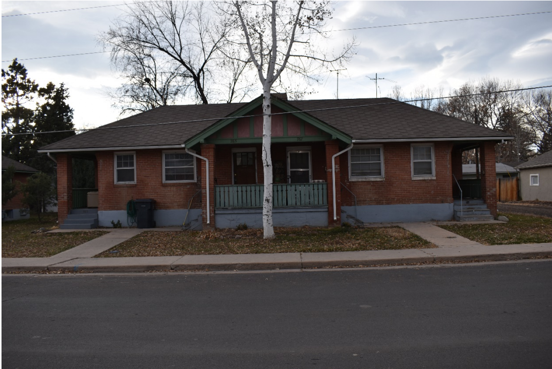
CD 1, Image 156, View to West