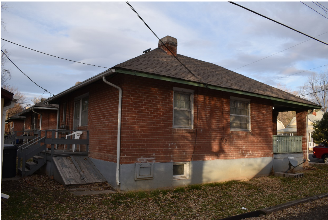
CD 1, Image 155, View to Northeast