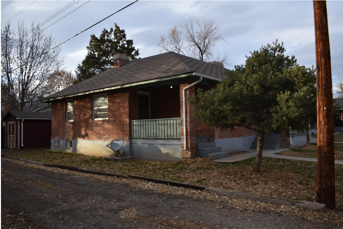
CD 1, Image 154, View to Northwest