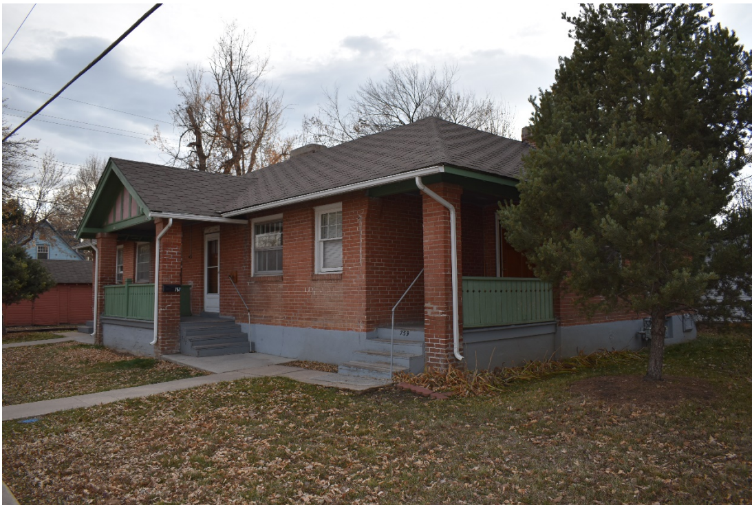
CD 1, Image 153, View to Southwest