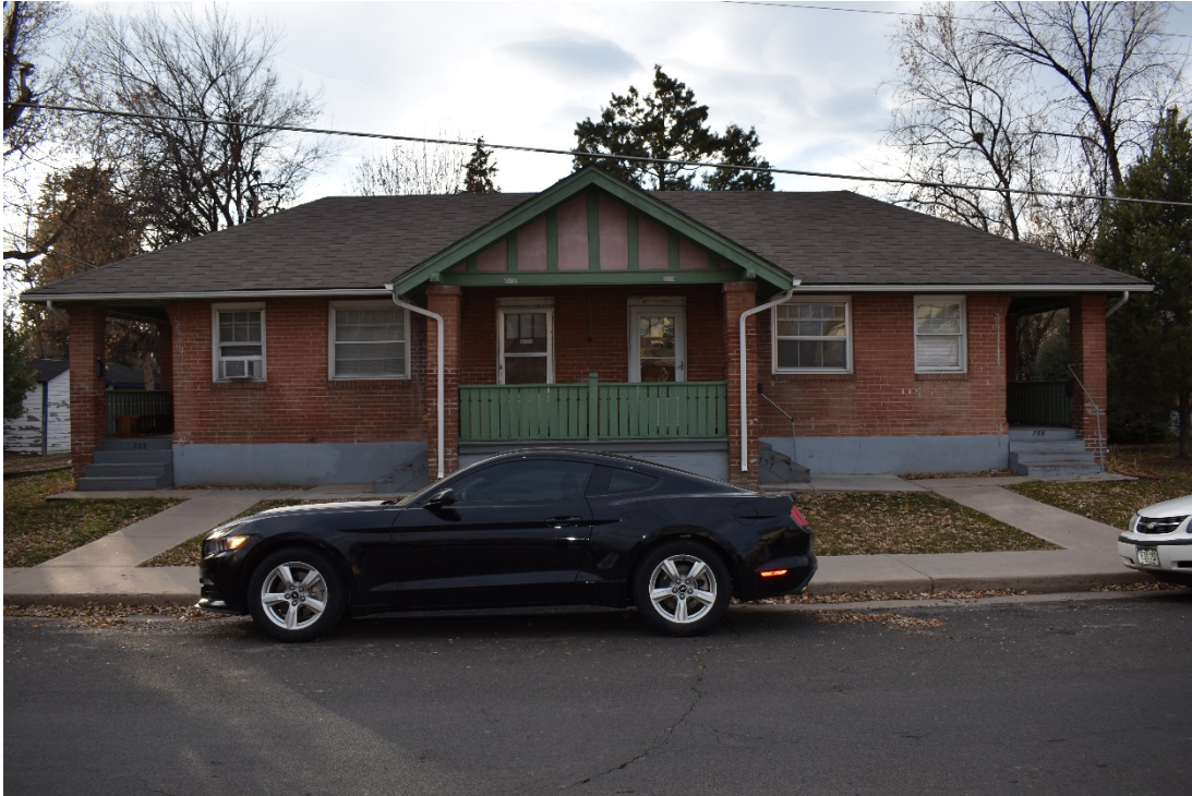
CD 1, Image 152, View to West