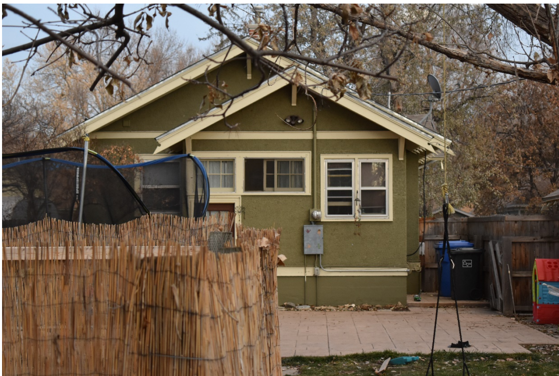
CD 1, Image 178, View to East, of the dwelling