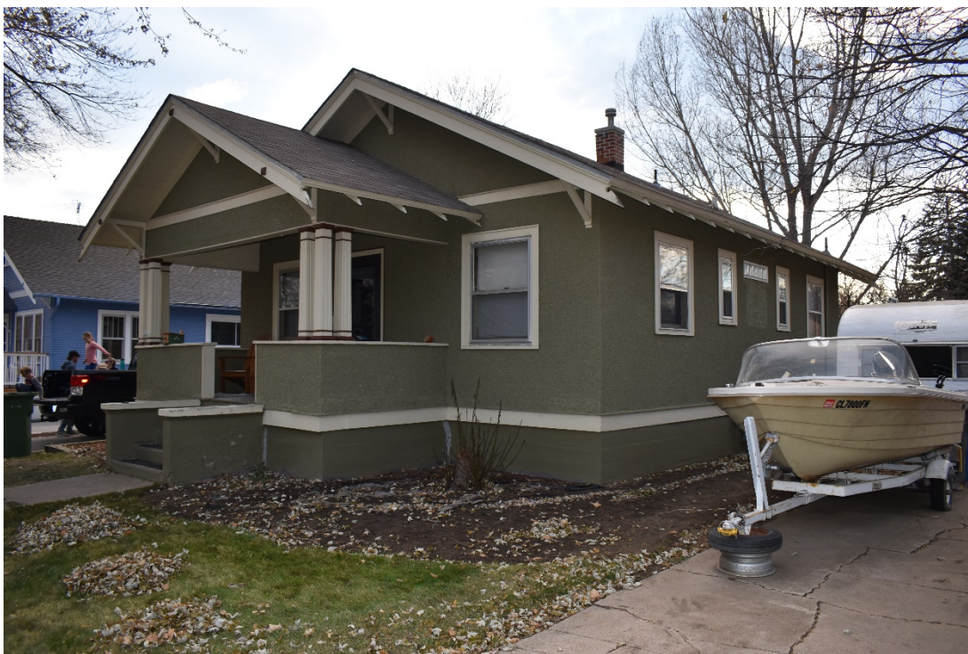
CD 1, Image 175, View to Southwest, of the dwelling