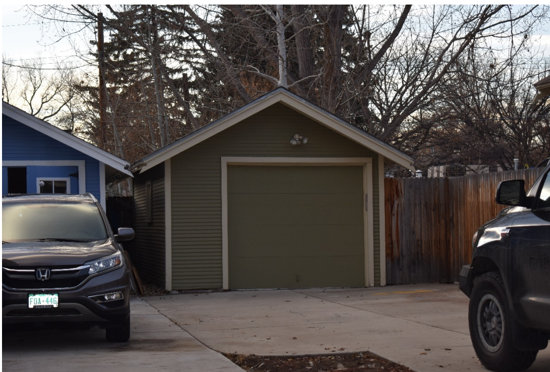
CD 1, Image 177, View to West, of the garage