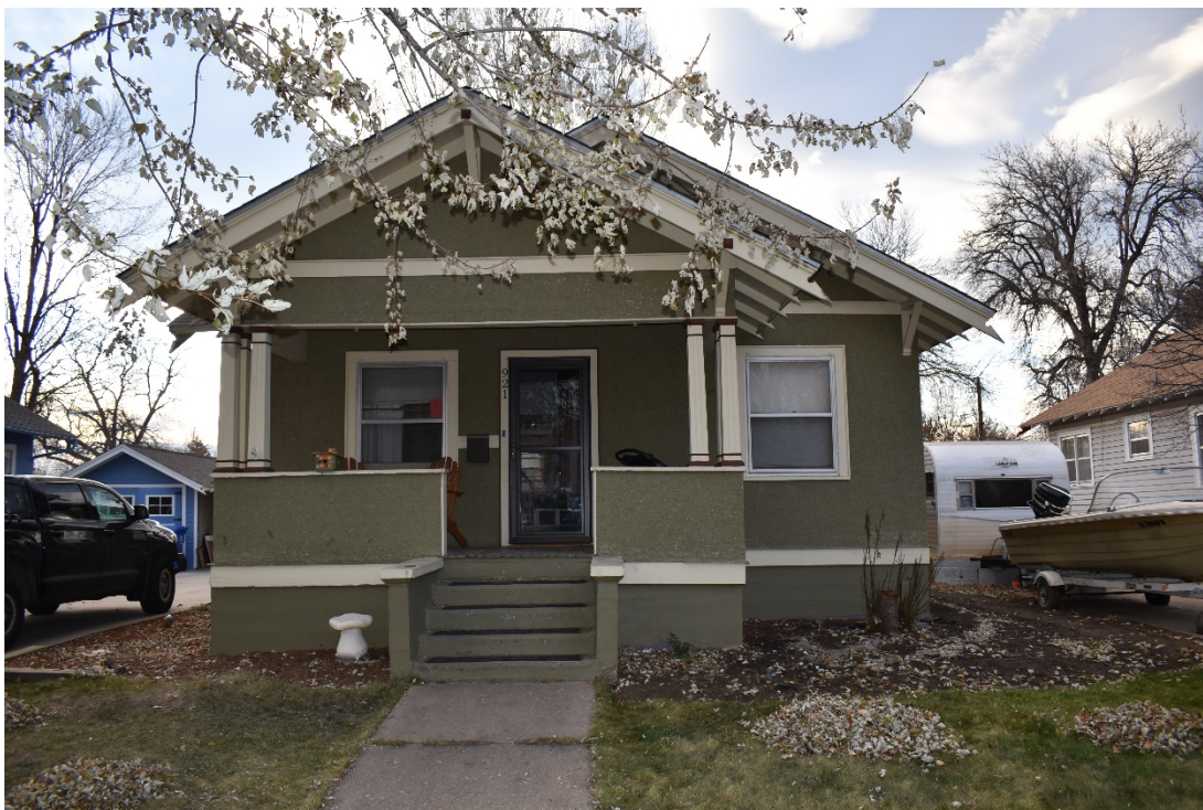
CD 1, Image 174, View to the West, of the dwelling