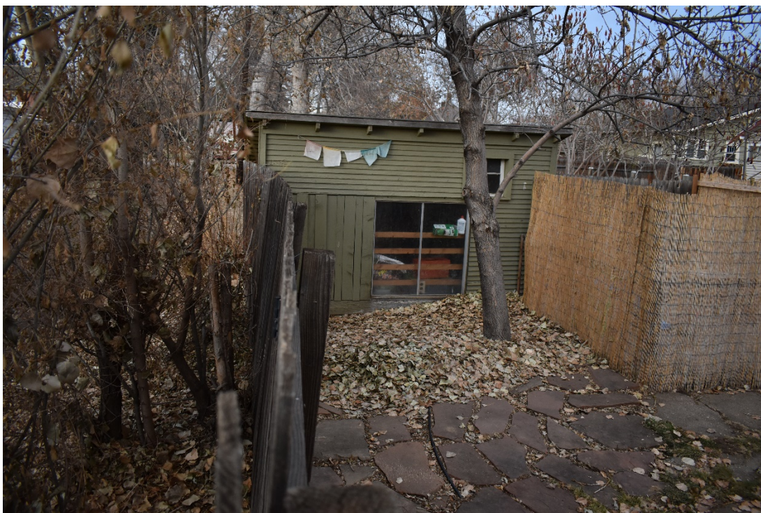
CD 1, Image 179, View to North, of the shed