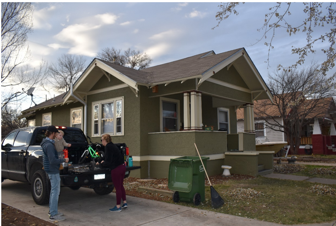
CD 1, Image 176, View to Northwest, of the dwelling