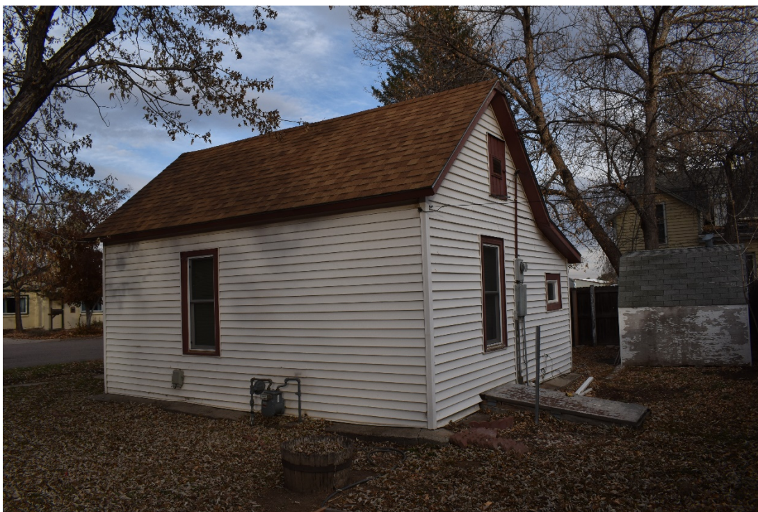
CD 1, Image 148, View to Northeast, of the dwelling