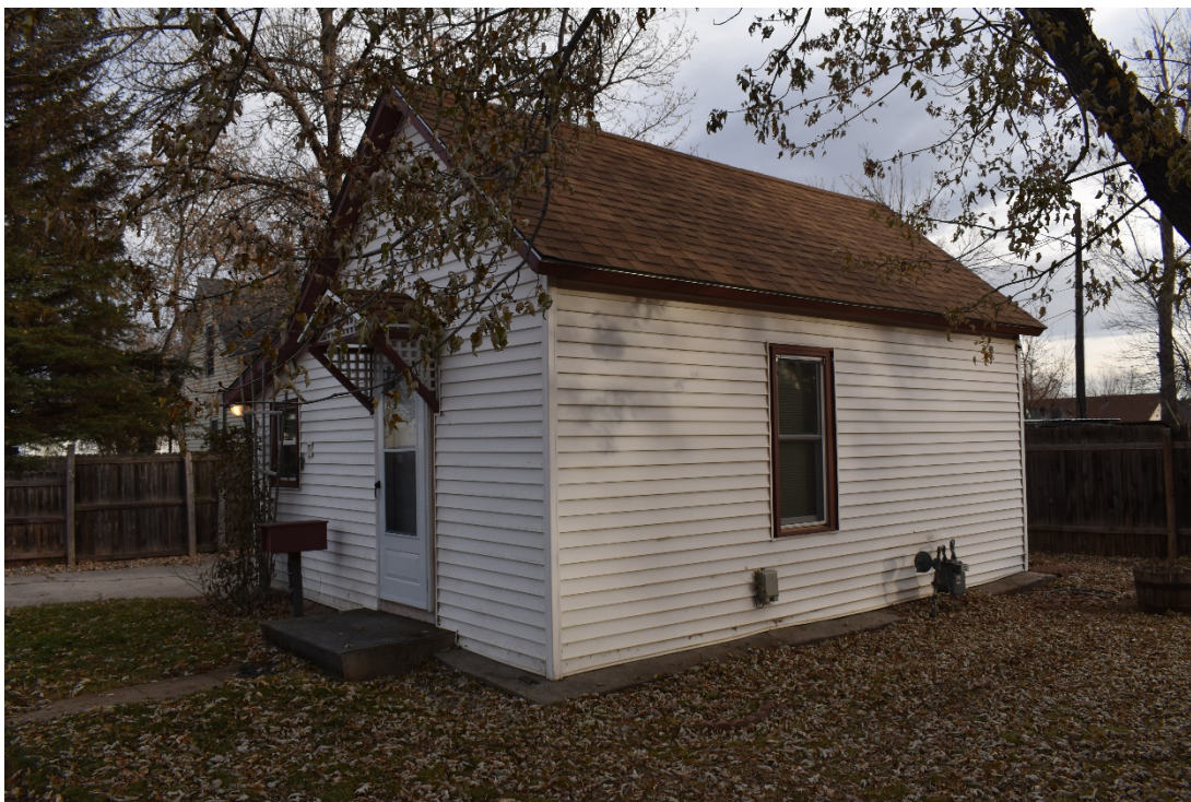
CD 1, Image 147, View to Southeast, of the dwelling