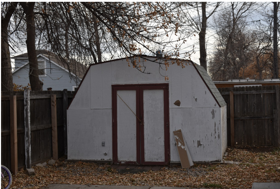
CD 1, Image 151, View to South, of the shed