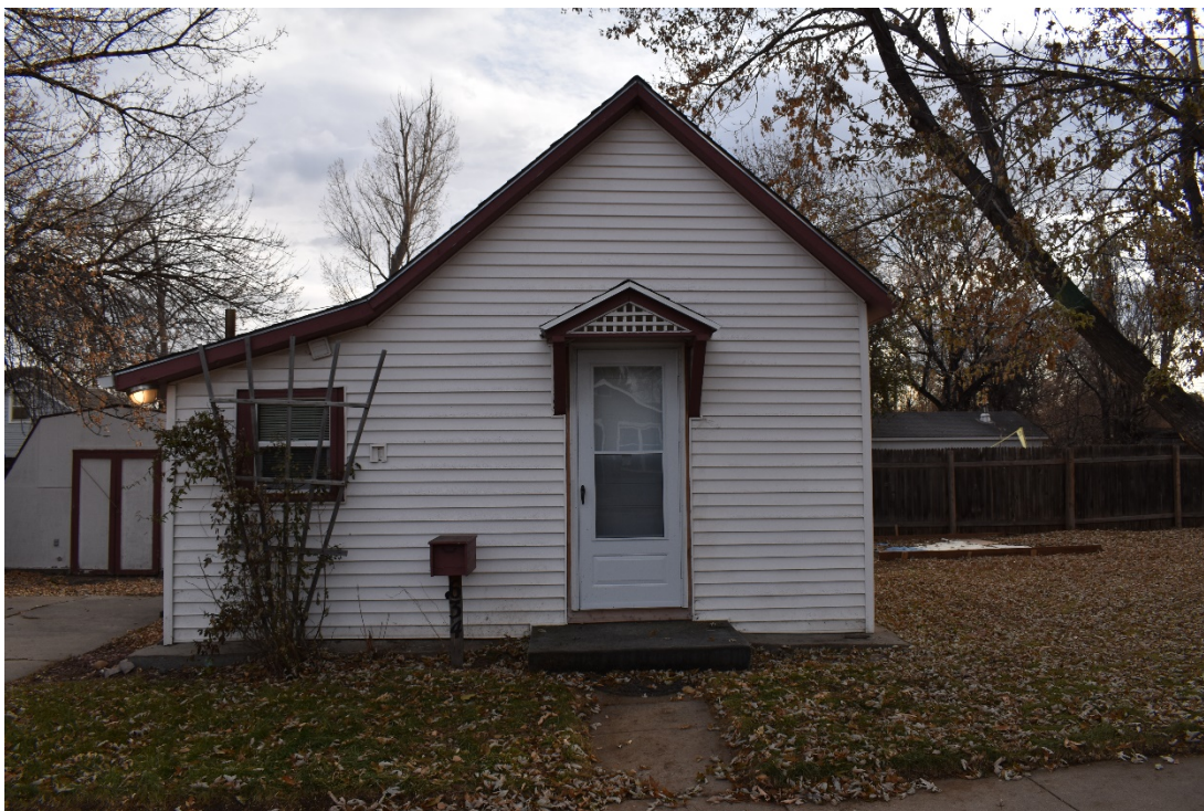
CD 1, Image 145, View to South, of the dwelling