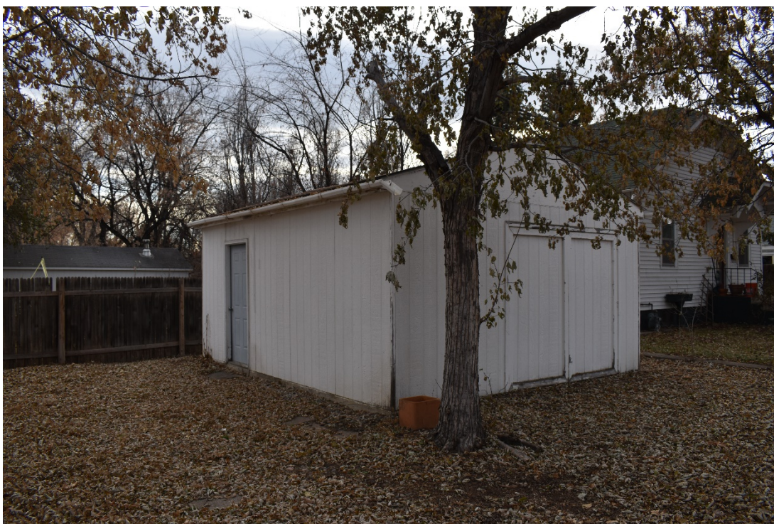
CD 1, Image 150, View to Southwest, of the garage