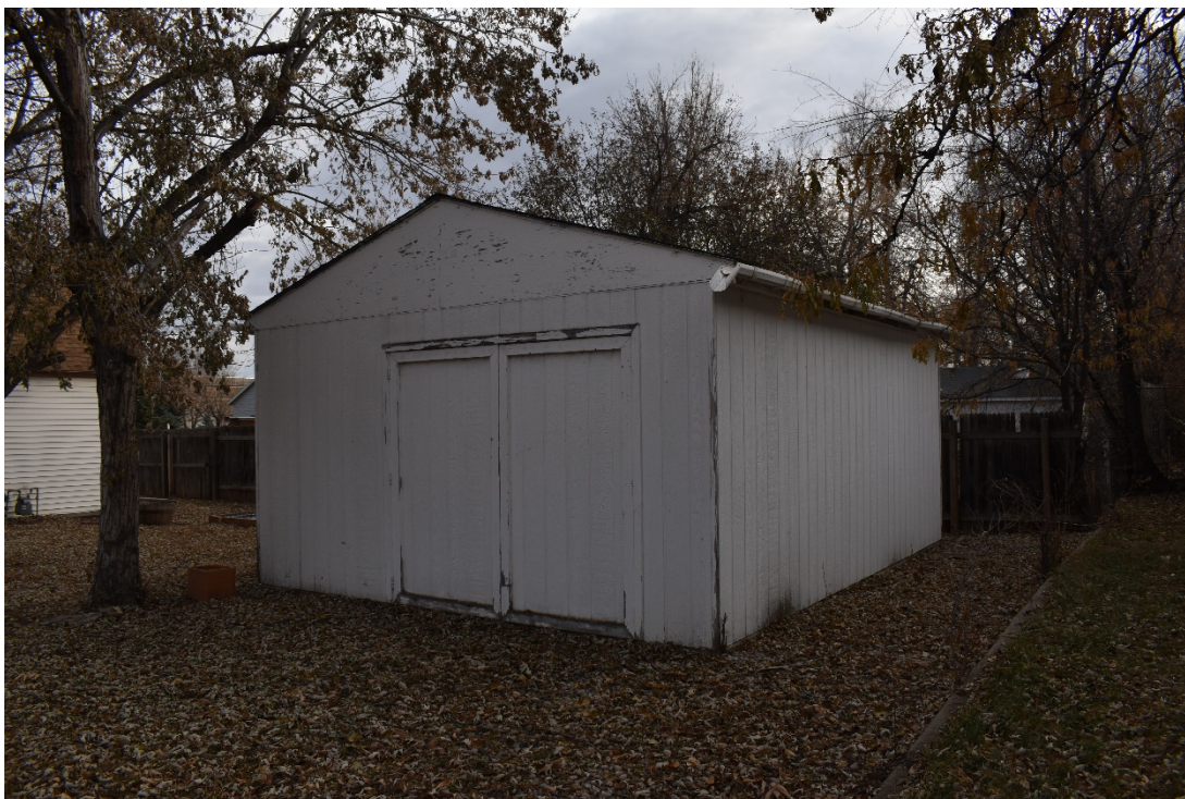
CD 1, Image 149, View to Southeast, of the garage