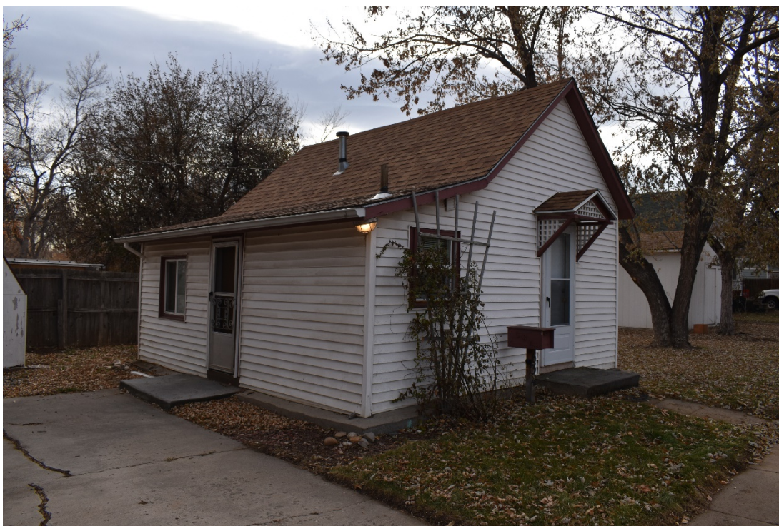
CD 1, Image 146, View to Southwest, of the dwelling