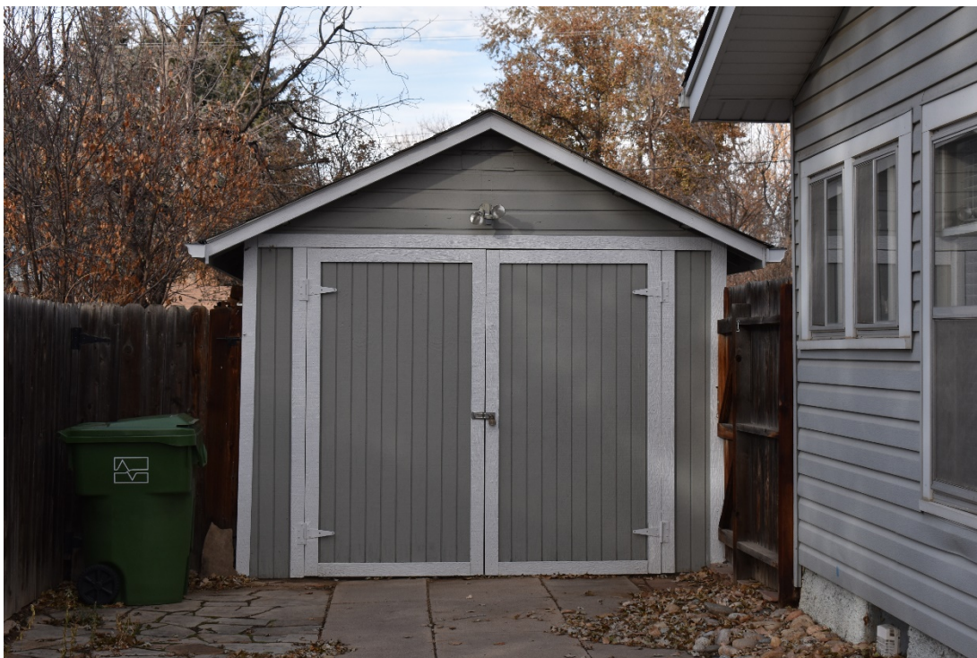
CD 1, Image 129, View to North, of the garage