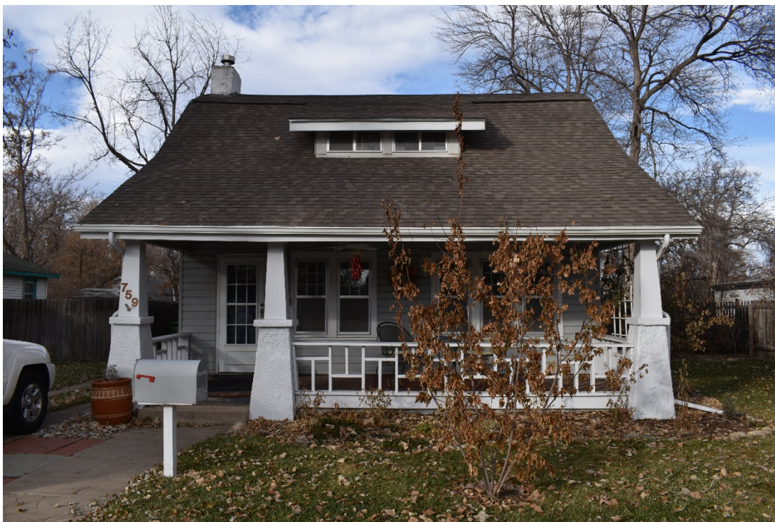
CD 1, Image 123, View to North, of the dwelling