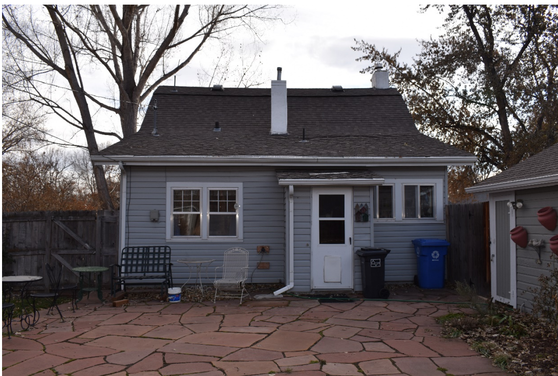
CD 1, Image 126, View to South, of the dwelling