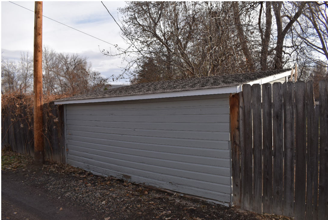
CD 1, Image 130, View to Southeast, of the shed