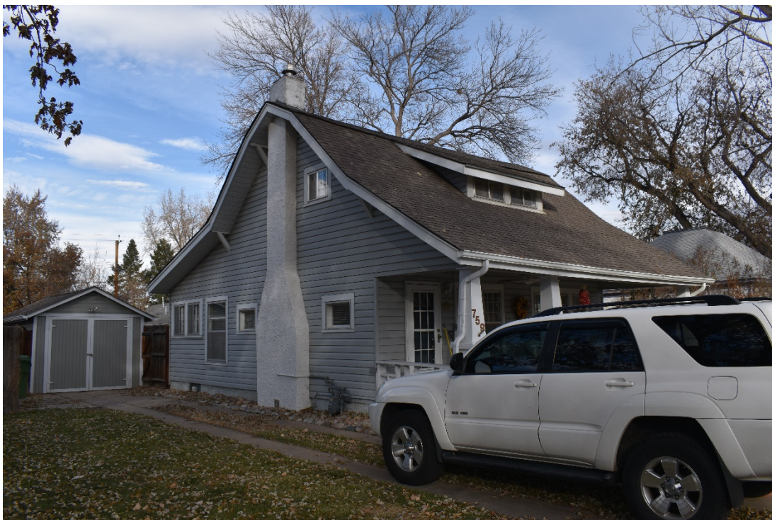
CD 1, Image 125, View to Northeast, of the dwelling