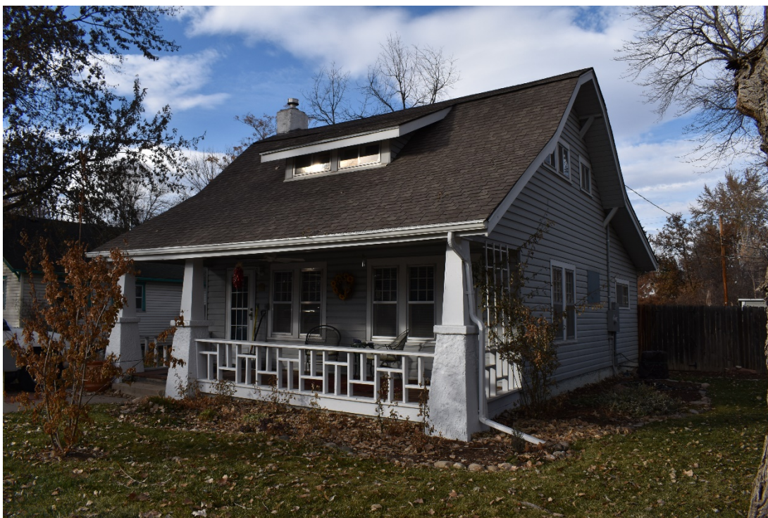
CD 1, Image 124, View to Northwest, of the dwelling