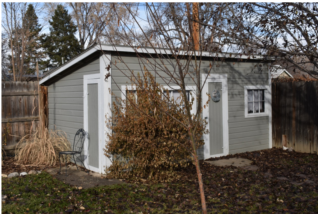
CD 1, Image 128, View to Northeast, of the shed