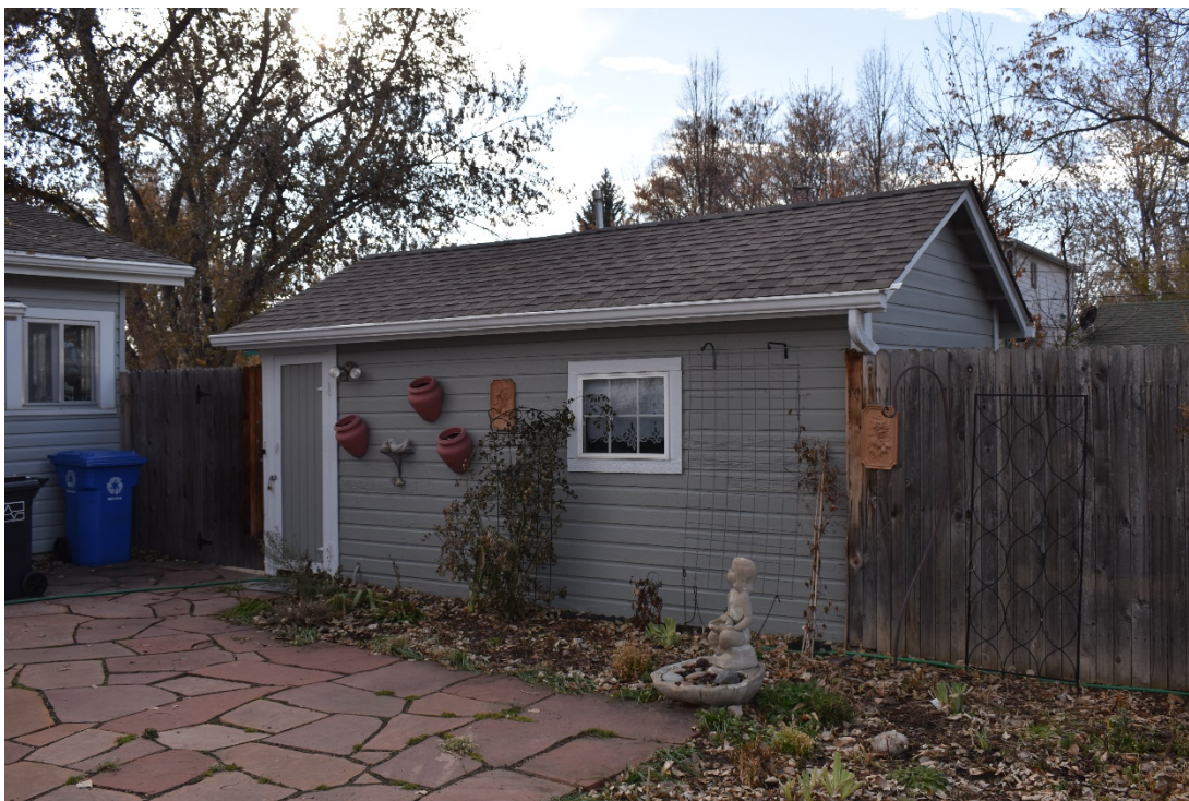
CD 1, Image 127, View to Southwest, of the garage