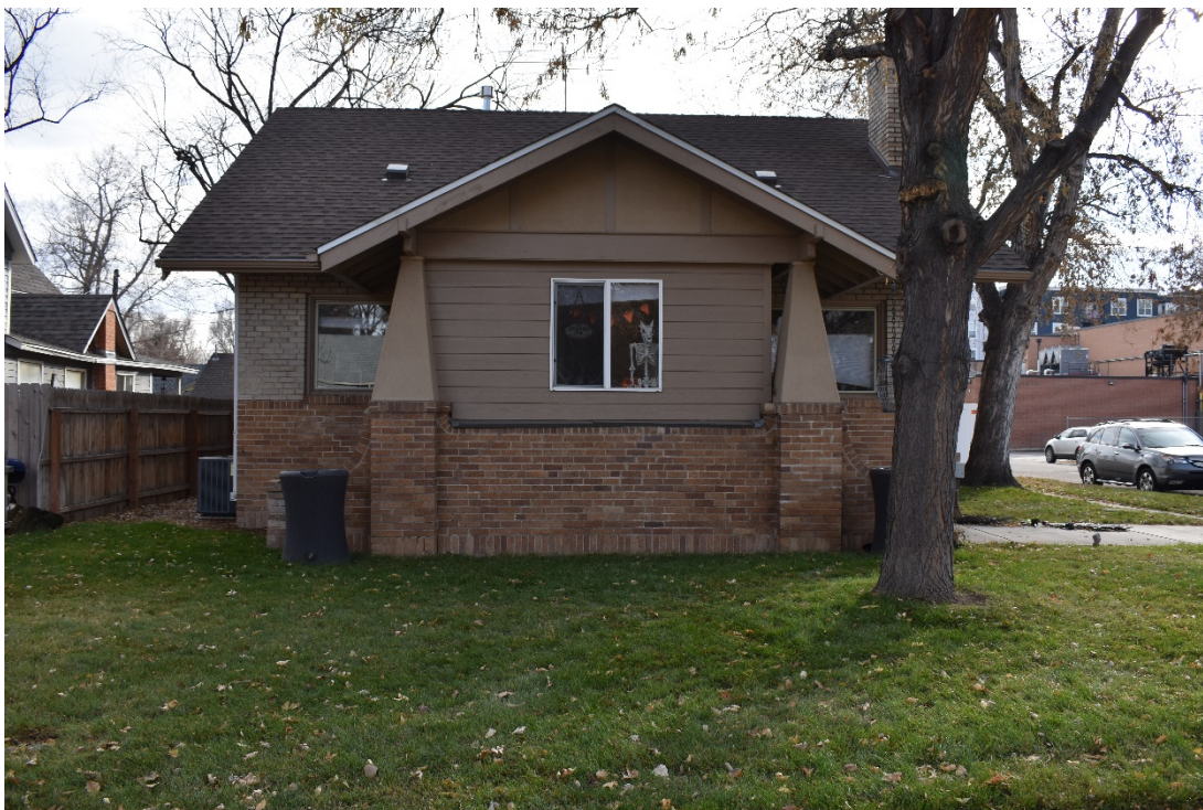
CD 1, Image 111, View to South