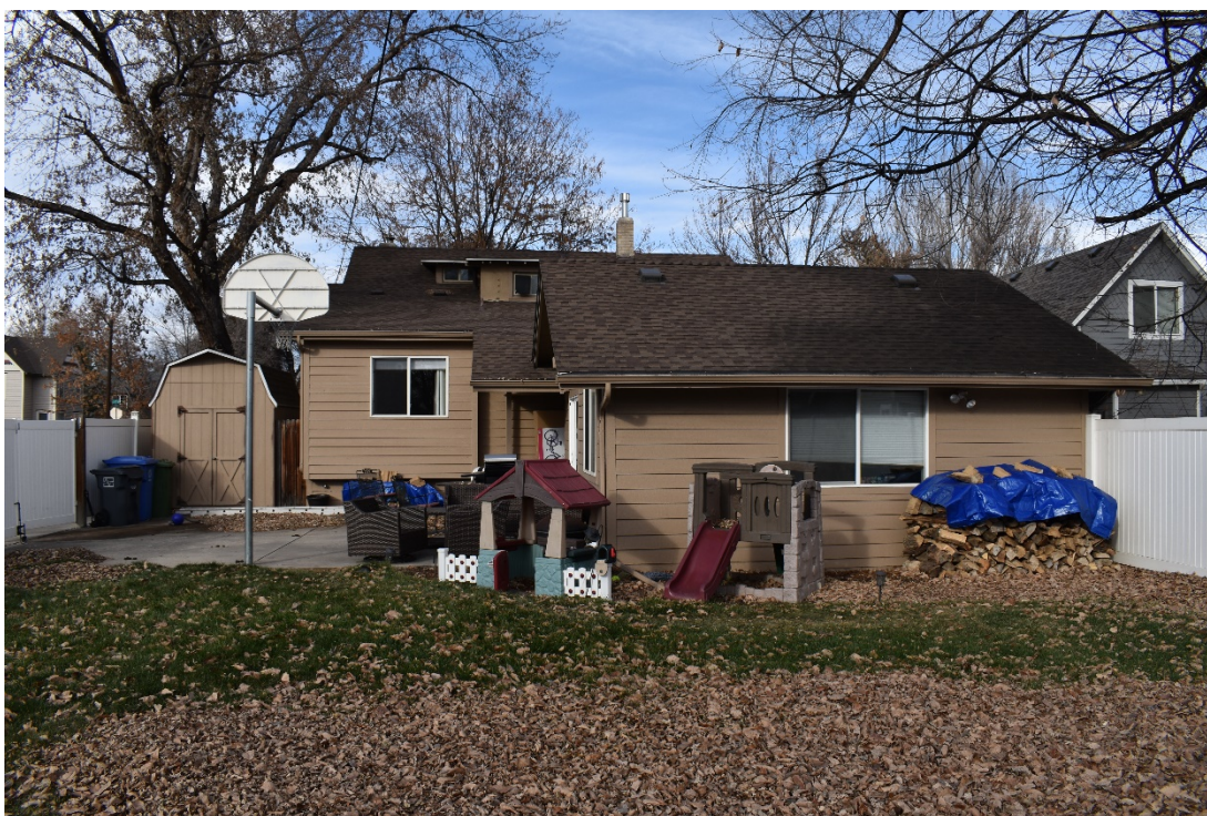
CD 1, Image 116, View to North