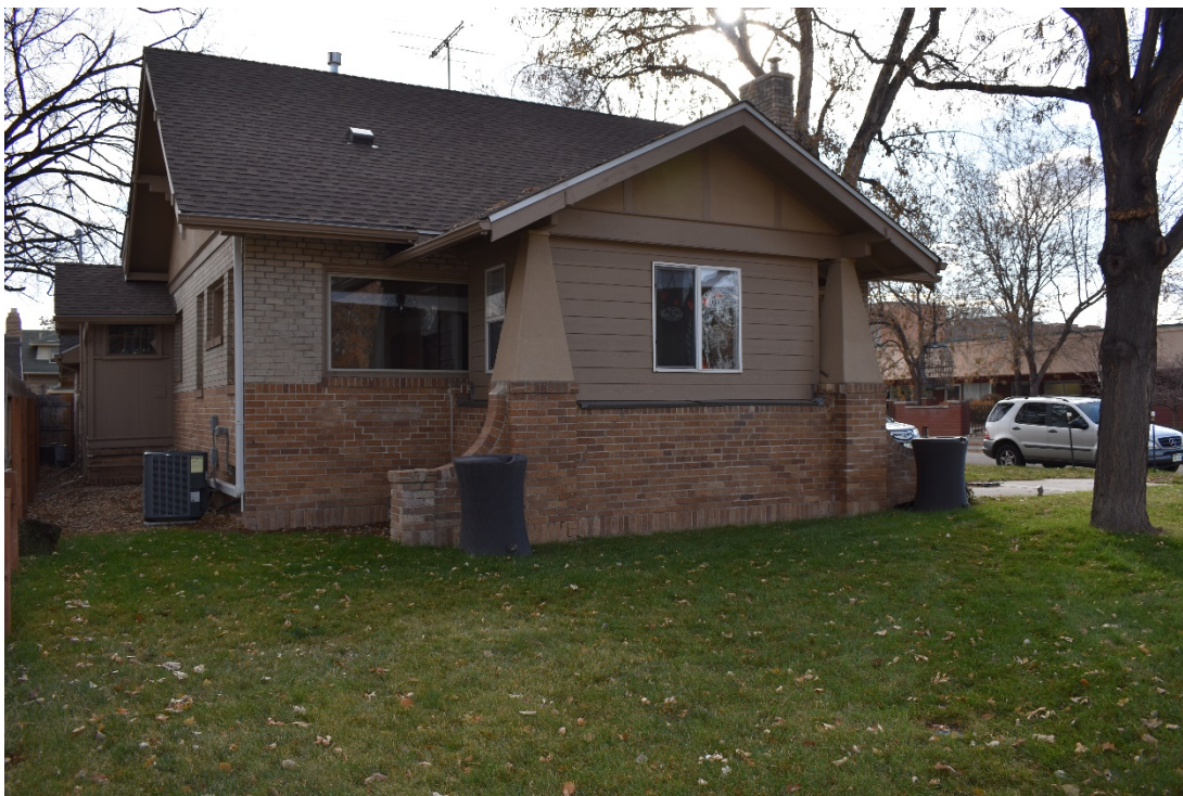
CD 1, Image 113, View to South-southwest