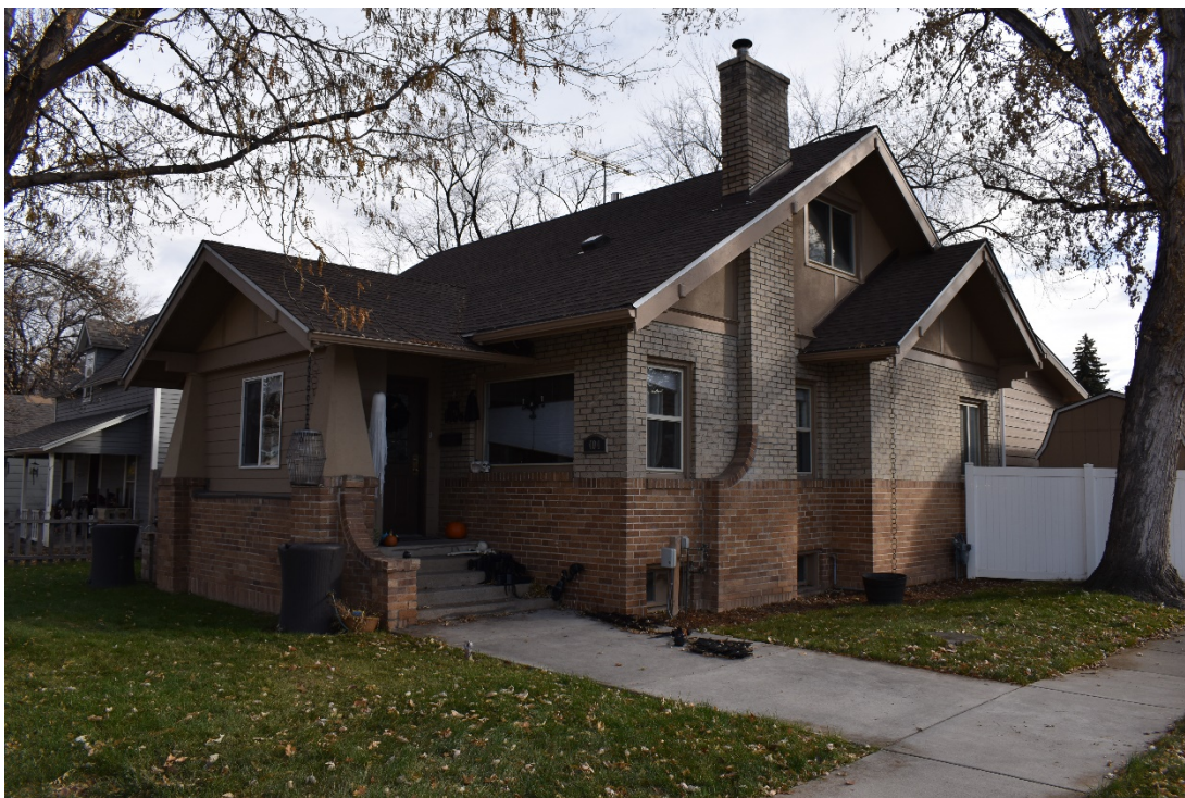
CD 1, Image 112, View to Southeast