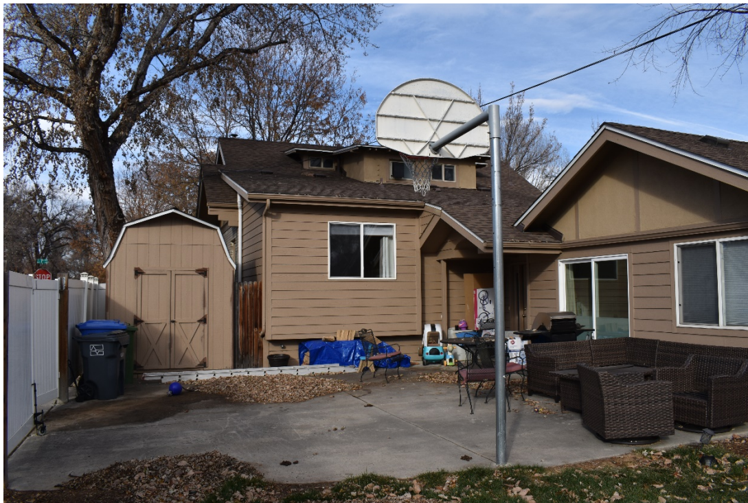
CD 1, Image 114, View to North-northeast