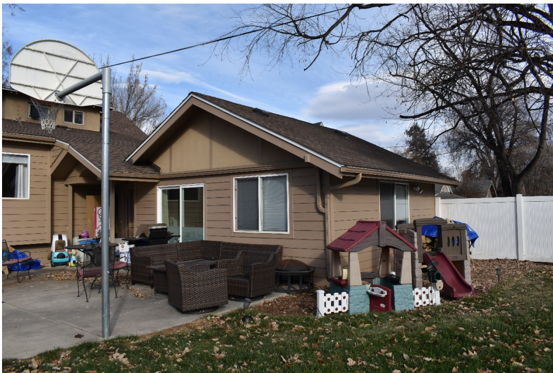
CD 1, Image 115, View to Northeast