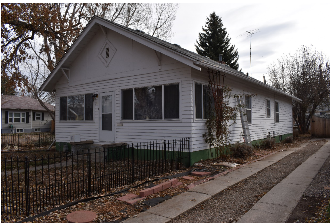
CD 1, Image 104, View to Southeast, of the dwelling