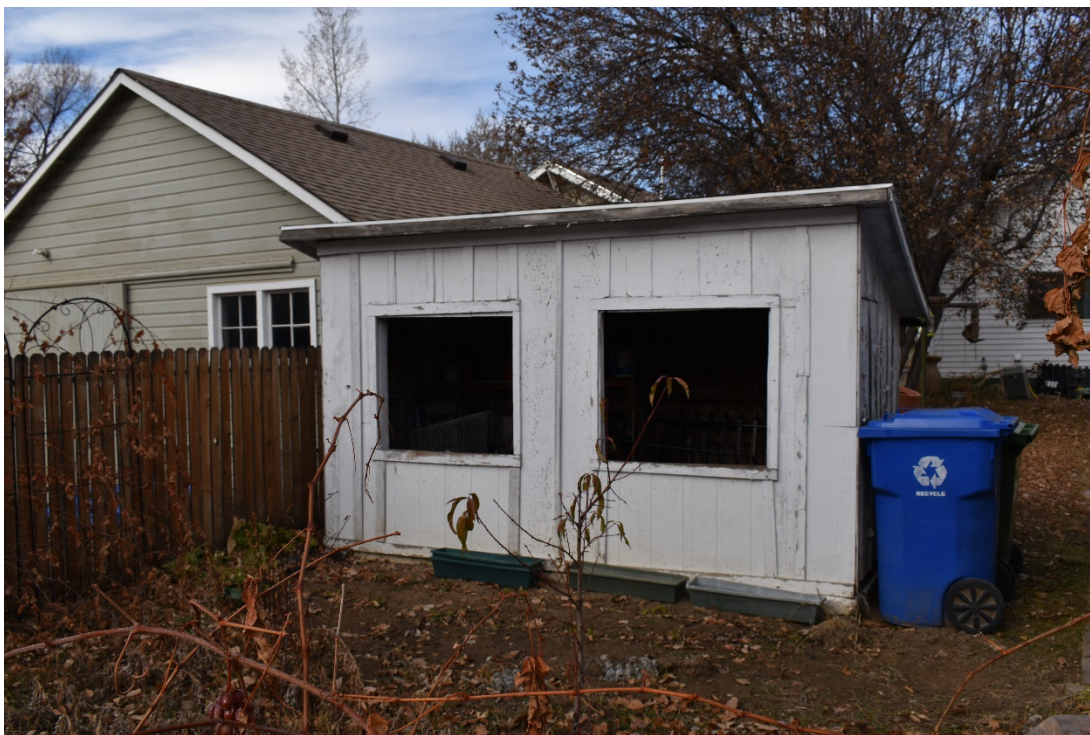
CD 1, Image 110, View to North-northwest, of the shed