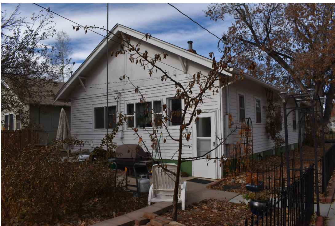
CD 1, Image 106, View to Northwest, of the dwelling