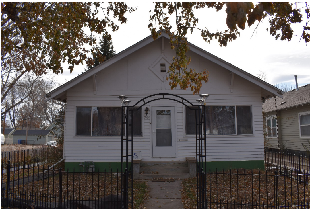
CD 1, Image 103, View to South, of the dwelling