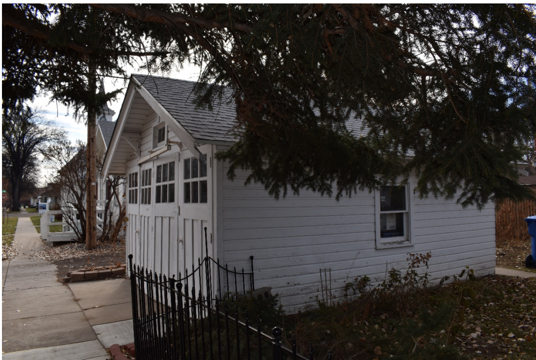
CD 1, Image 107, View to South-southwest, of the garage