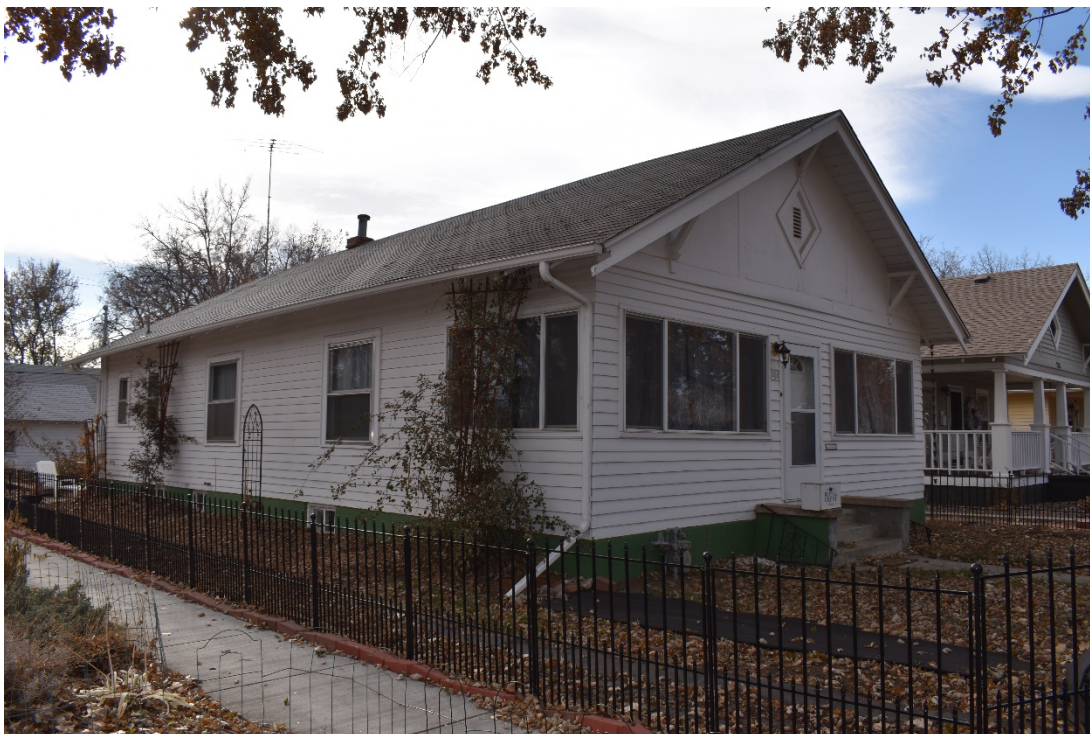
CD 1, Image 105, View to Southwest, of the dwelling