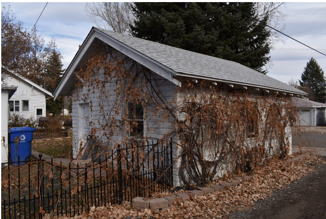
CD 1, Image 109, View to Northeast, of the garage