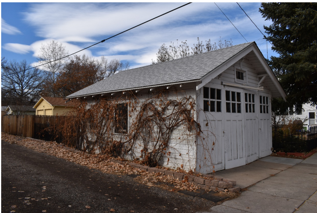
CD 1, Image 108, View to Northwest, of the garage