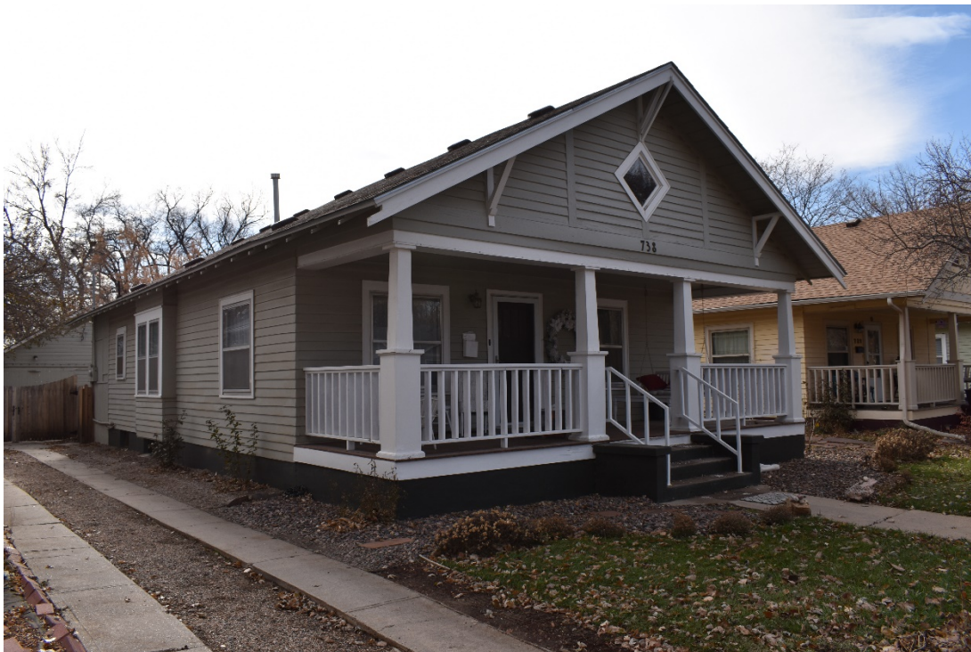
CD 1, Image 98, View to Southwest, of the dwelling