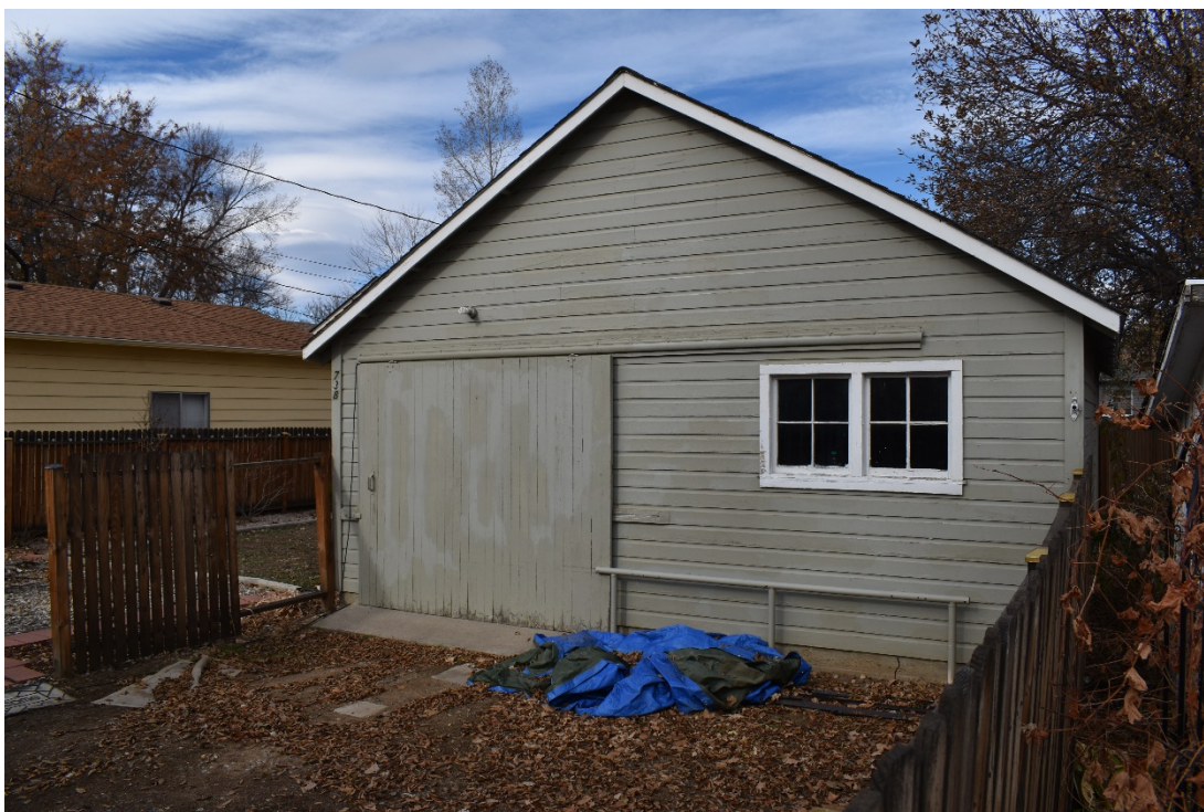
CD 1, Image 101, View to South-southwest, of the garage