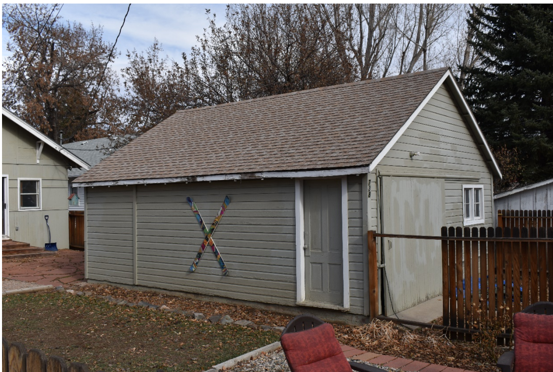
CD 1, Image 100, View to Northeast, of the garage