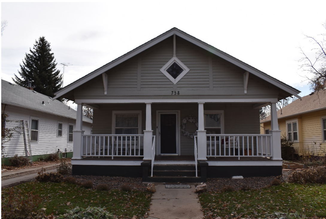
CD 1, Image 96, View to South, of the dwelling