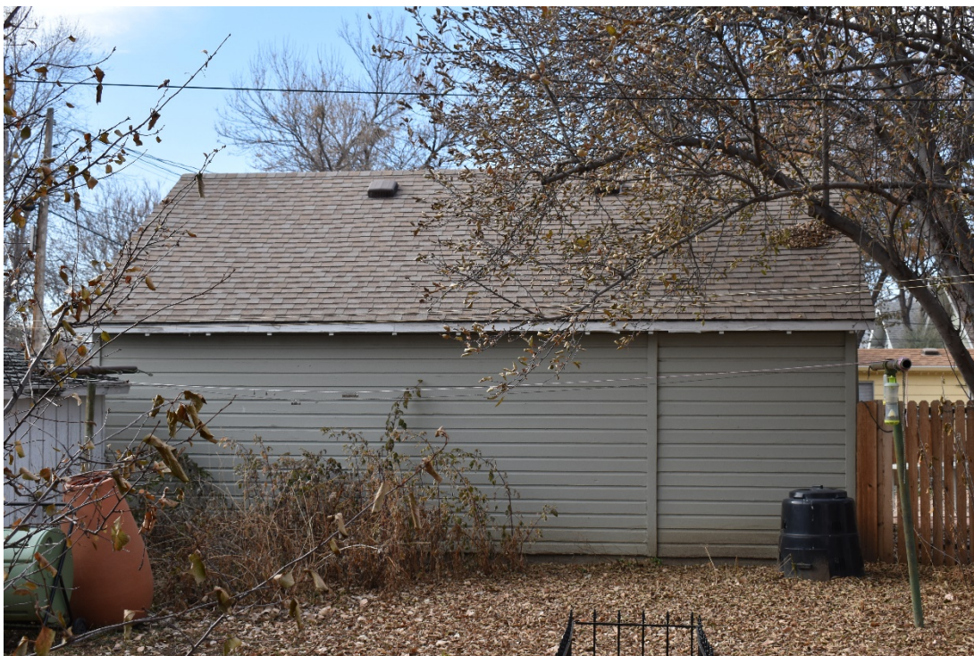
CD 1, Image 102, View to West, of the garage