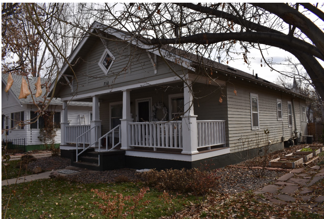
CD 1, Image 97, View to Southeast, of the dwelling