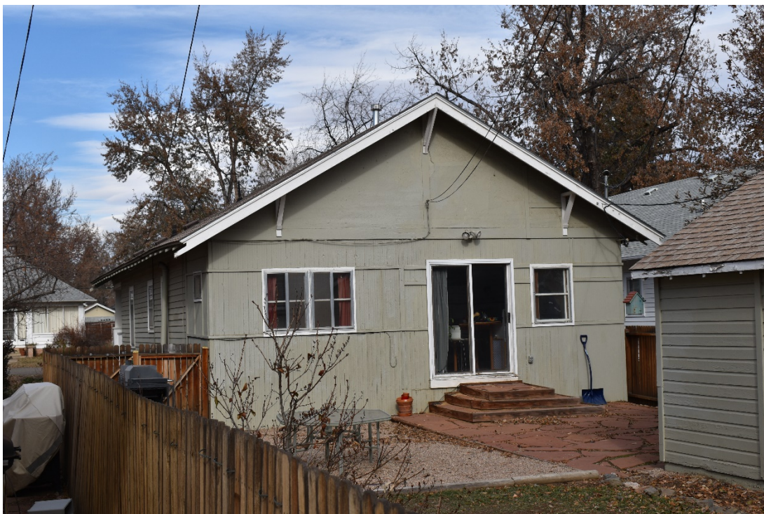
CD 1, Image 99, View to North-northeast, primarily of the dwelling