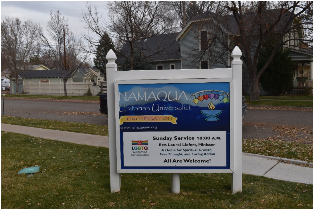
CD 1, Image 56, View to Northeast, of the sign near the front southeast corner of the property