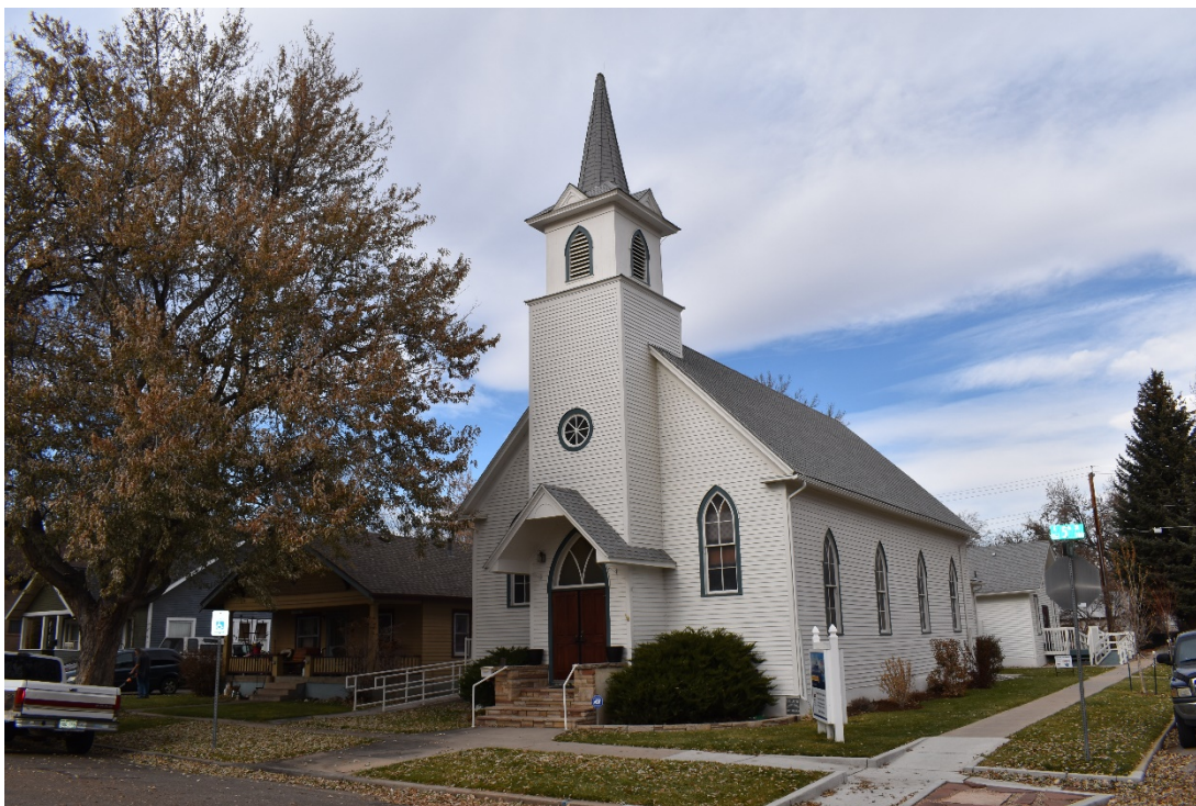
CD 1, Image 46, View to Northwest