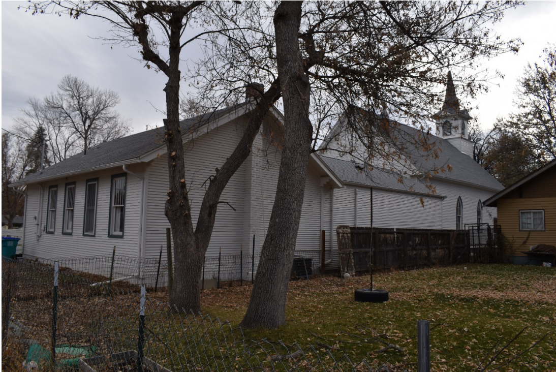
CD 1, Image 55, View to Southeast