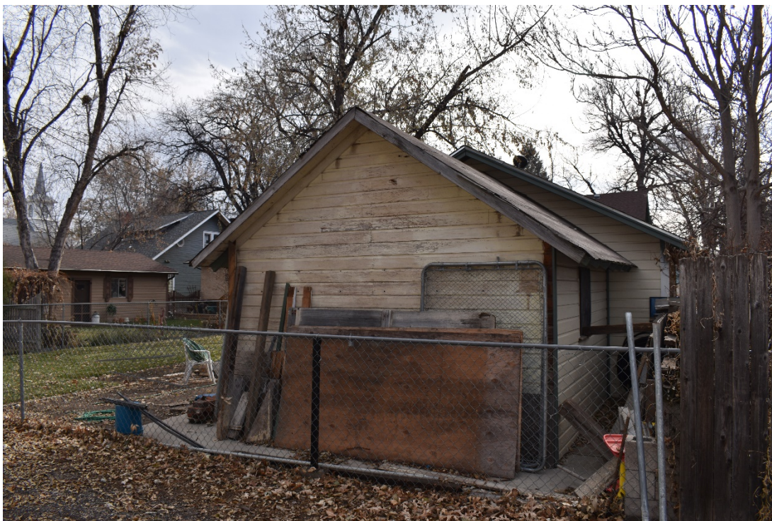
CD 1, Image 68, View to South-Southeast, of the garage and shed