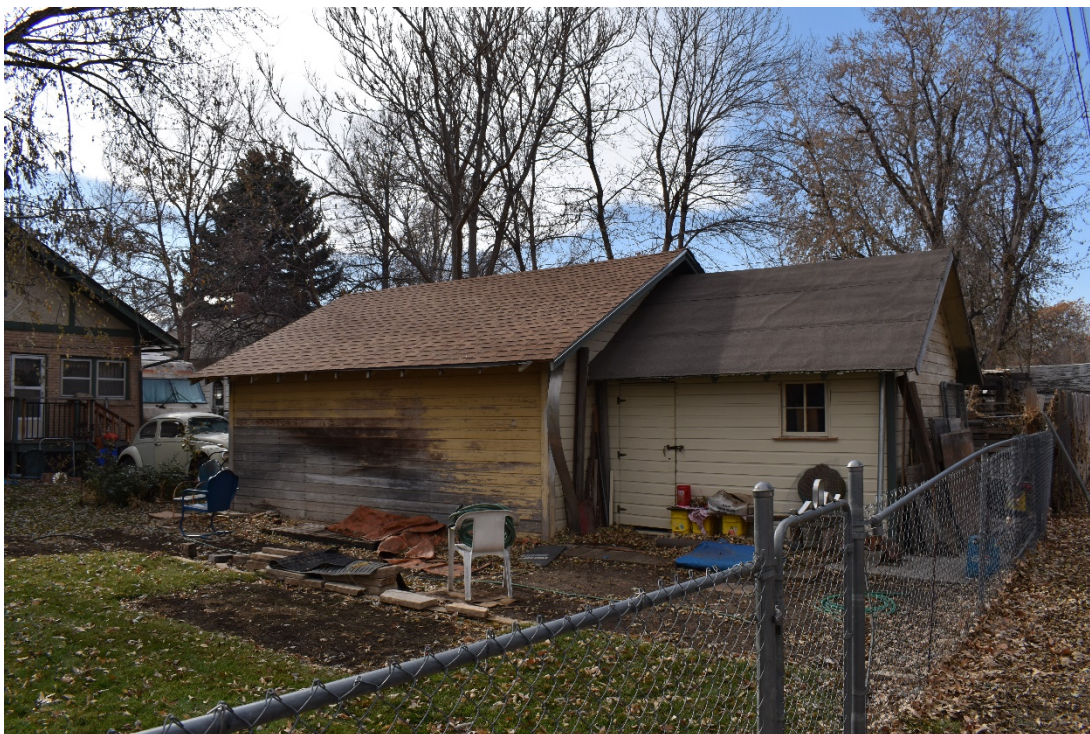
CD 1, Image 67, View to West-Southwest, of the garage and shed