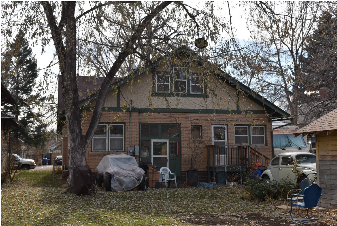
CD 1, Image 66, View to South, of the dwelling