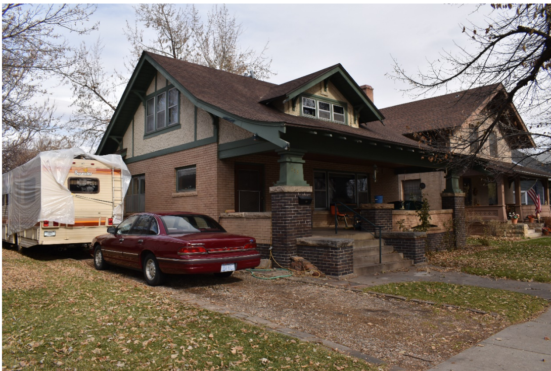
CD 1, Image 65, View to Northeast, of the dwelling