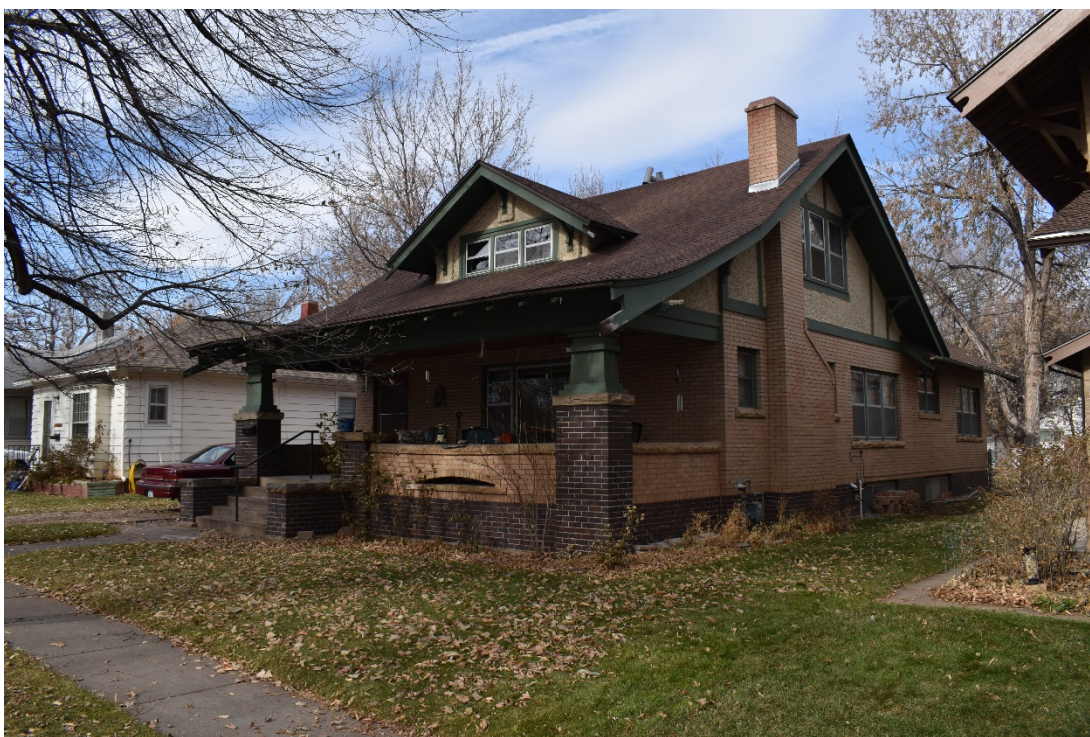
CD 1, Image 64, View to Northwest, of the dwelling