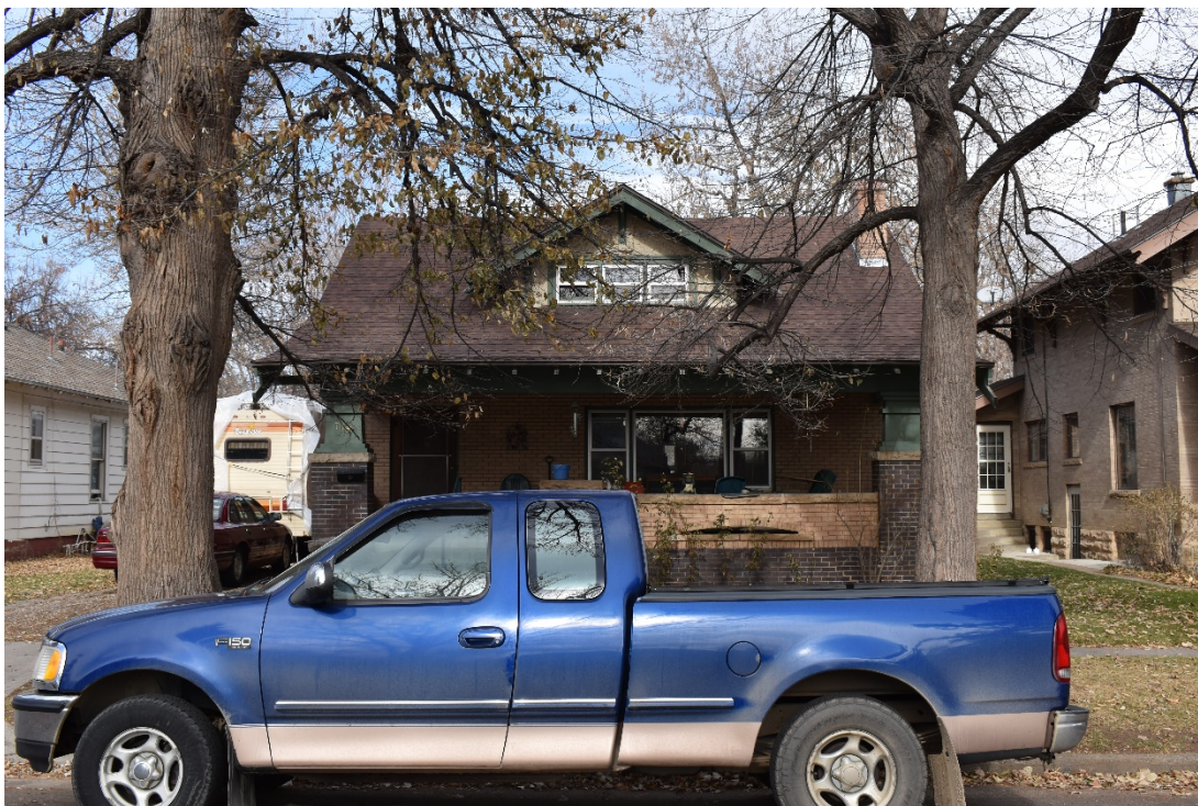
CD 1, Image 63, View to North, of the dwelling