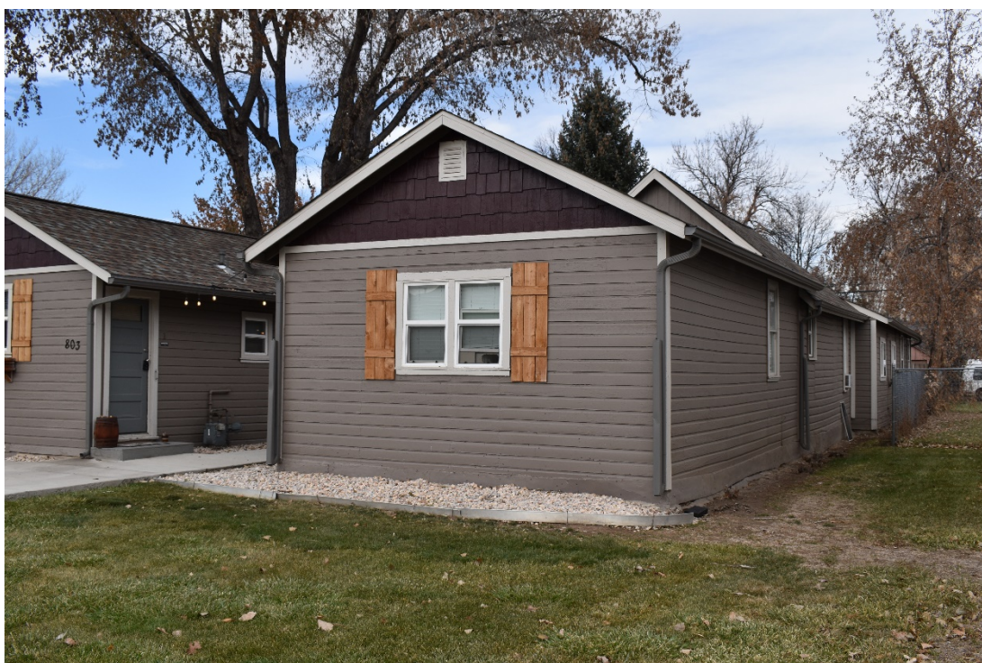
CD 1, Image 38, View to Northwest, primarily of the south and east walls of the east building