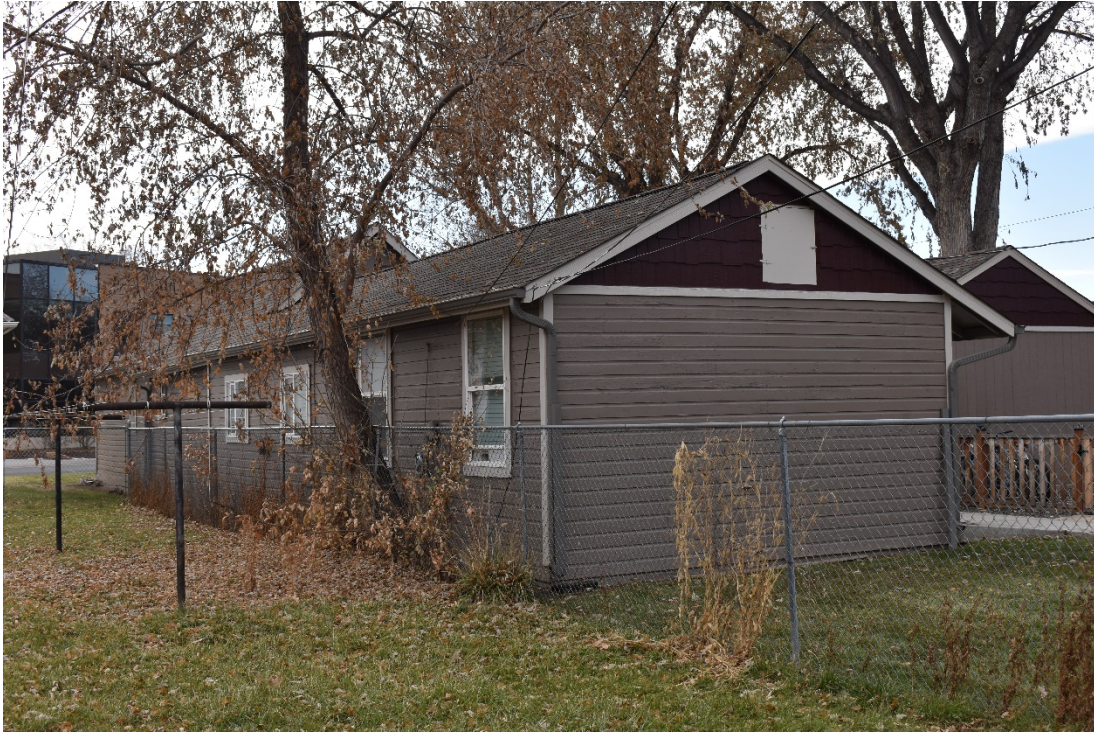
CD 1, Image 41, View to Southwest, of the east and north walls of the east building