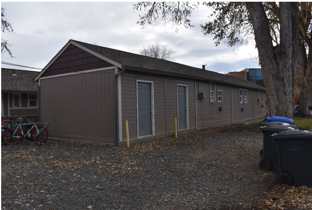
CD 1, Image 44, View to Southeast, of the north and west walls of the west building