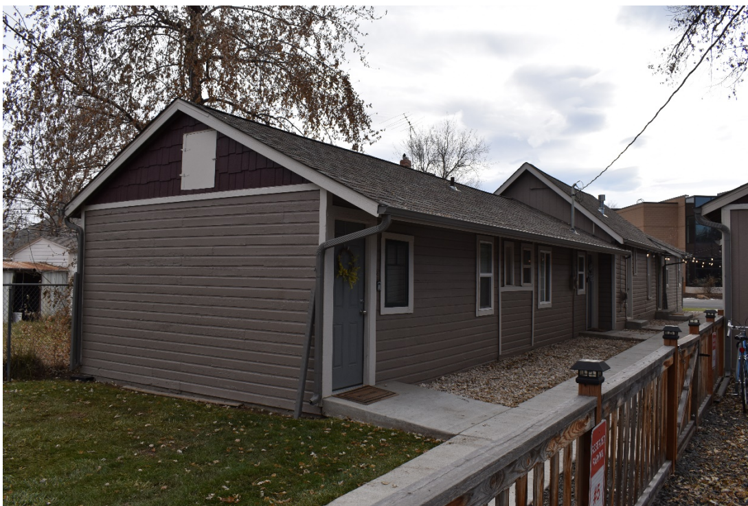
CD 1, Image 40, View to Southeast, of the north and west walls of the east building