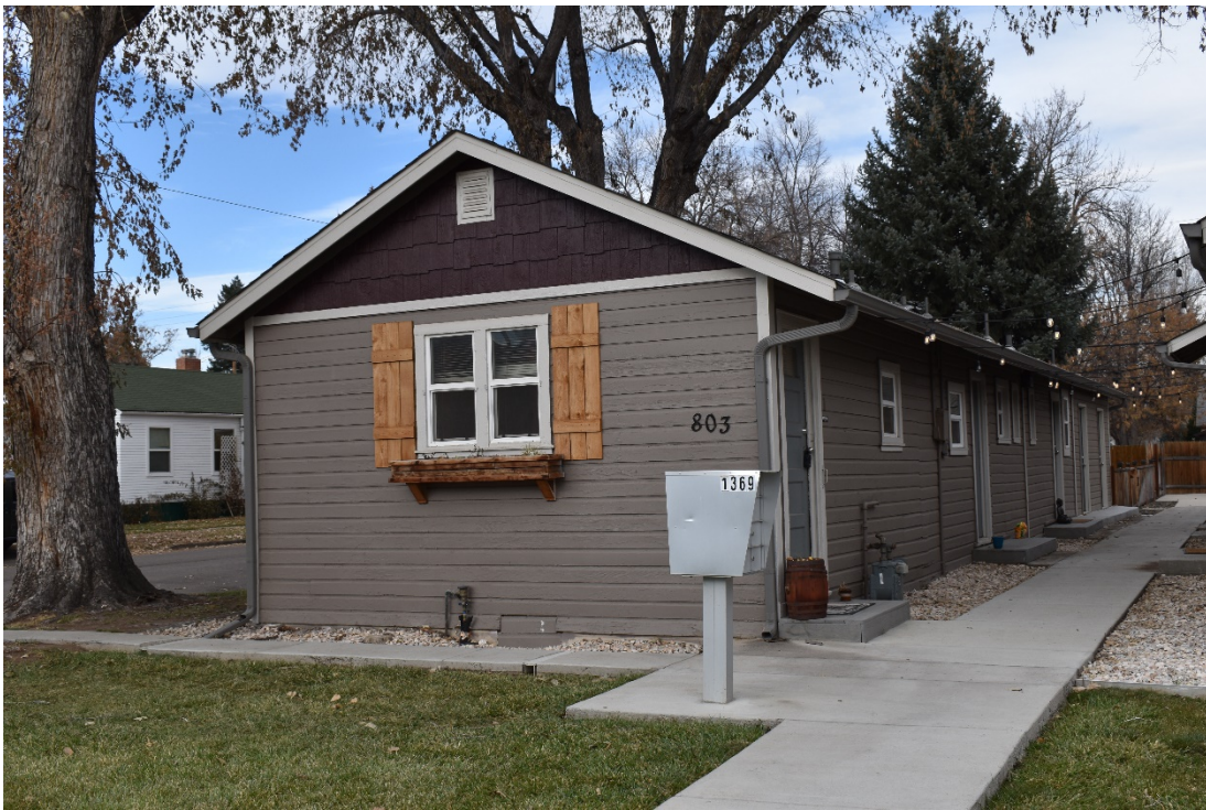
CD 1, Image 42, View to Northwest, of the south and east walls of the west building