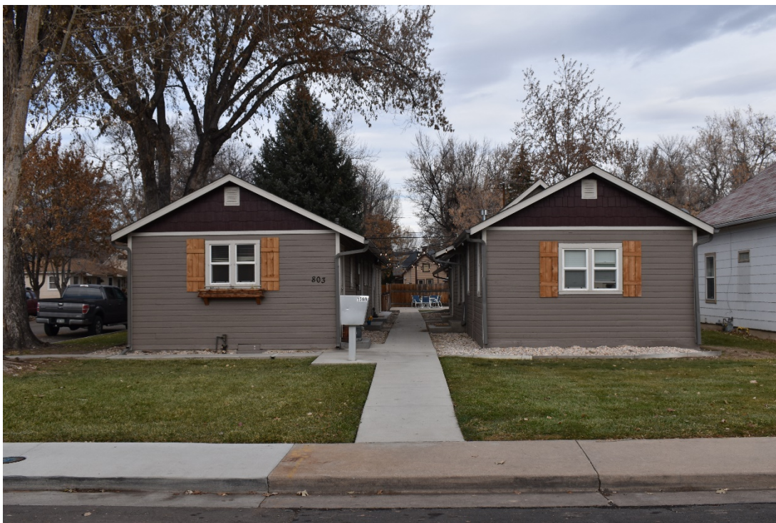
CD 1, Image 37, View to north, of both buildings