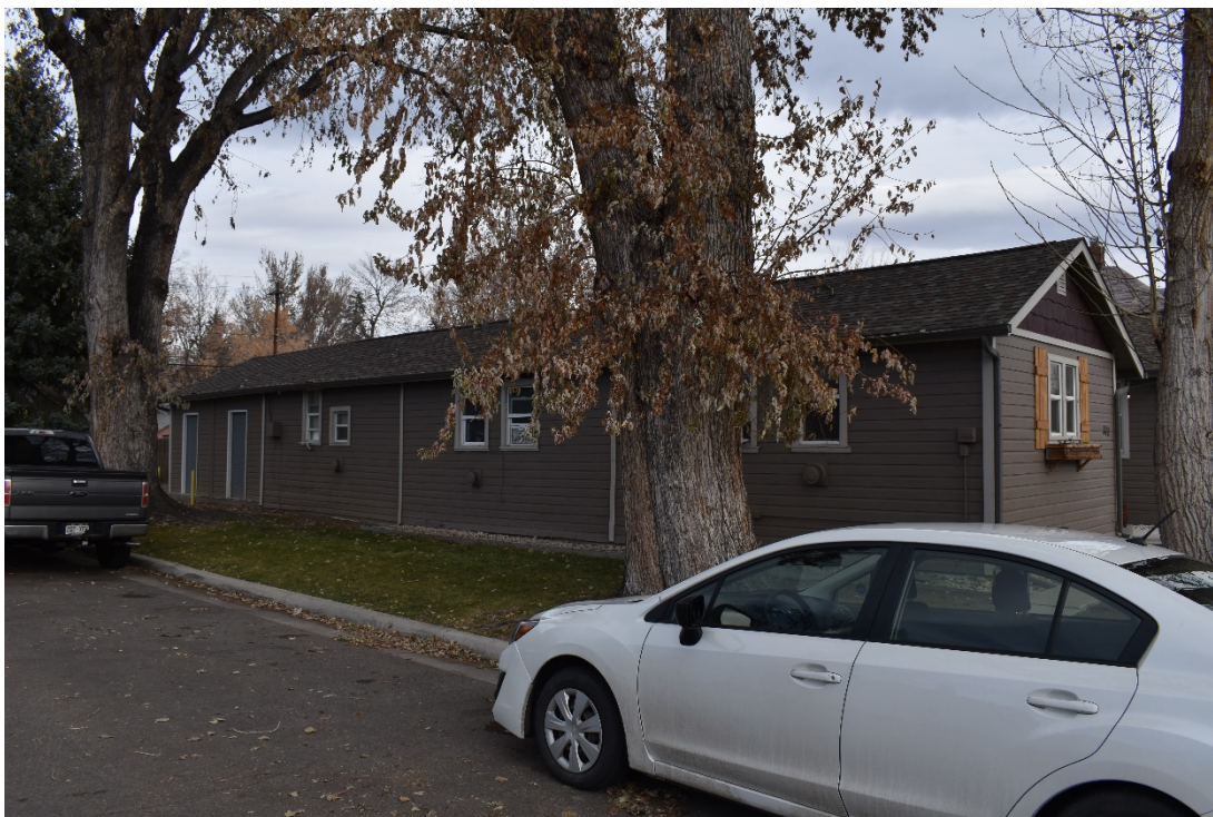
CD 1, Image 43, View to Northeast, of the west and south walls of the west building