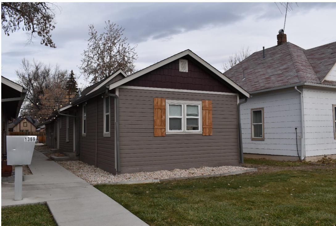
CD 1, Image 39, View to Northeast, primarily of the south and west walls of the east building