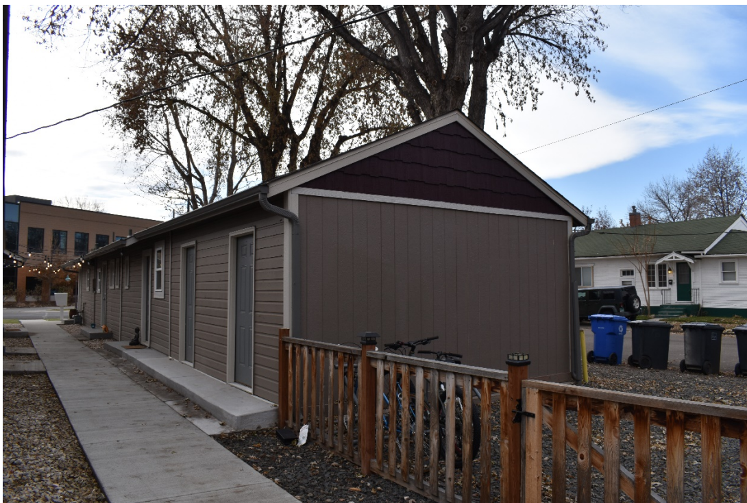
CD 1, Image 45, View to Southwest, of the east and north walls of the west building