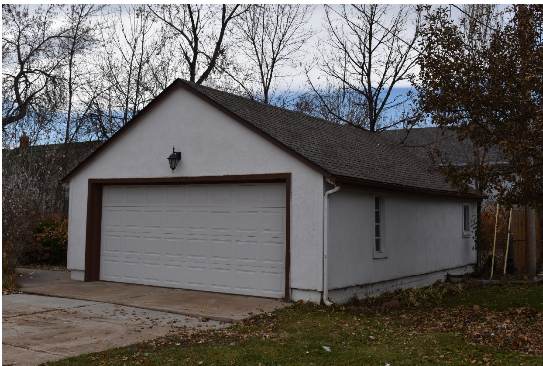
CD 1, Image 20, View to Southwest, of the Garage