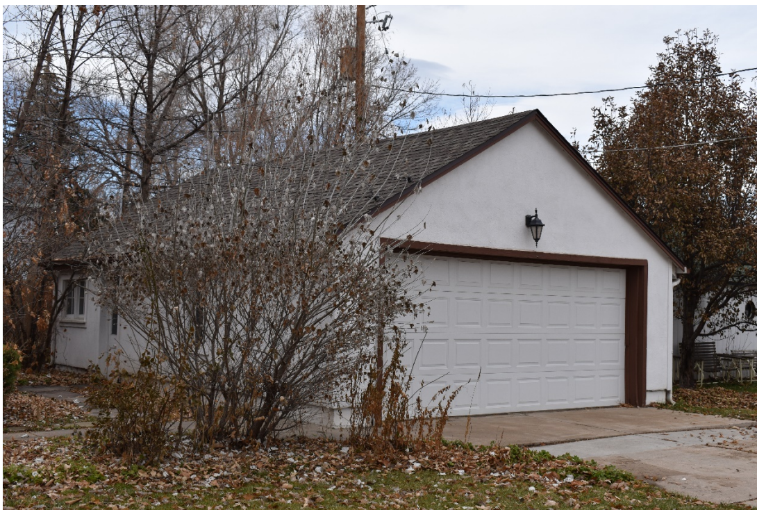
CD 1, Image 19, View to Northwest, of the Garage