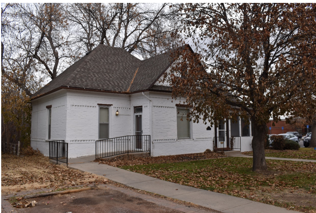
CD 1, Image 16, View to Northeast