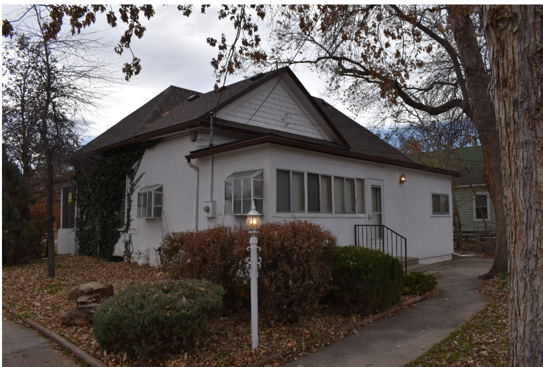
CD 1, Image 18, View to Southwest