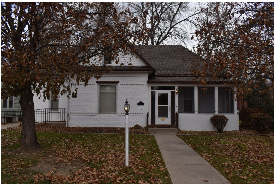
CD 1, Image 15, View to North