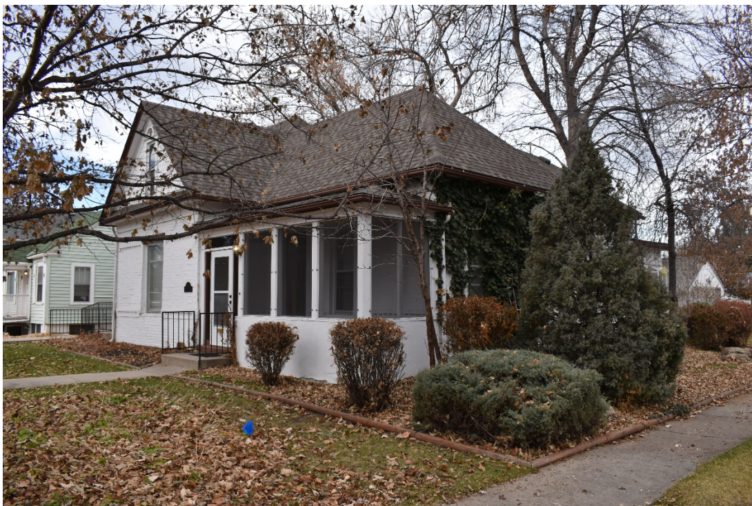
CD 1, Image 17, View to Northwest