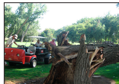
Tree Maintenance, Improvement & Safety Program