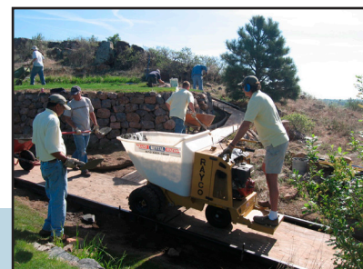
Improved Path on #14