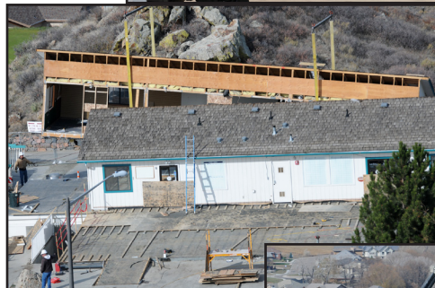
Above: Removal of the old clubhouse begins.