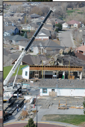
Removal of the old clubhouse is completed.