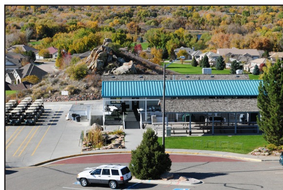
Above: Before demolition began.

In the meantime, it's business as usual on the golf course at Mariana Butte. Weather