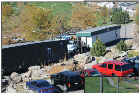
Above and Right: Preparing the temporary units for placement.