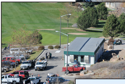
Right: The temporary clubhouse complete with entrances.