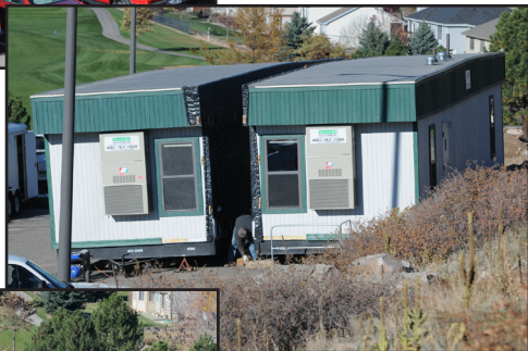
Left: The temporary clubhouse units together and sealed.