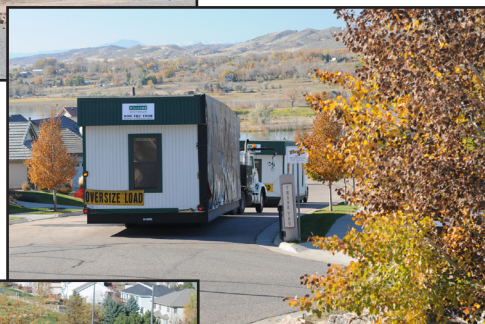
Above: The temporary clubhouse units arrive.