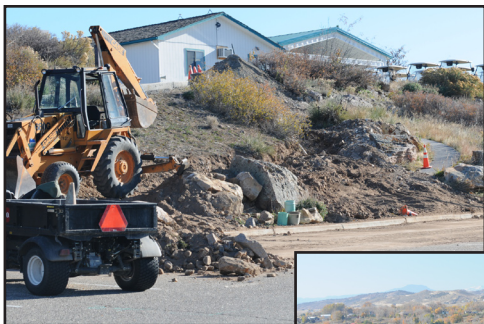
Above: Prep work for temporary clubhouse.

this newsletter as well as online at: www.golfloveland.com . ■