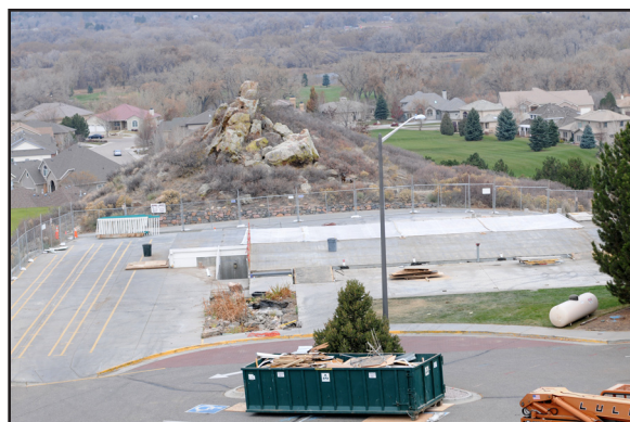
Below: After demolition, we're ready to build!