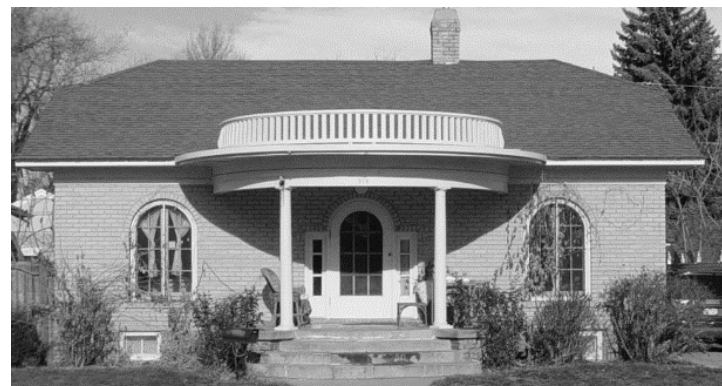
Bill Reed House 813 W 4 th St (1923)