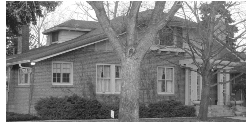
Harter Borland House N Jefferson (1920)