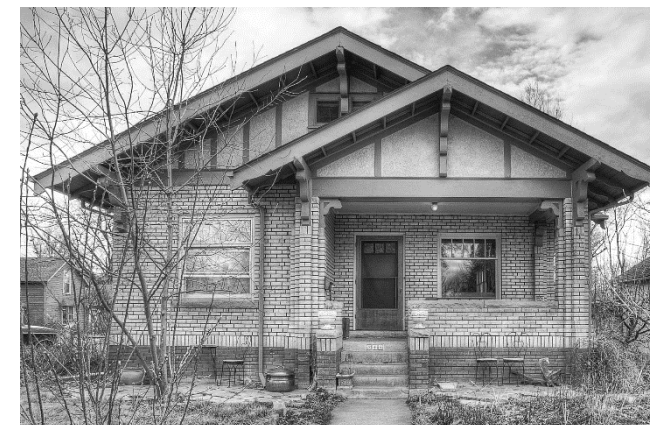
Uhrich Residence 948 N Jefferson(1919)