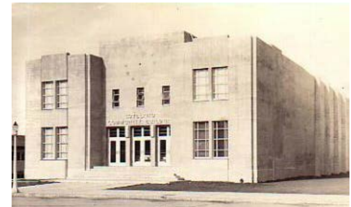
Pulliam Community Building 545 N Cleveland (C 1937-39)