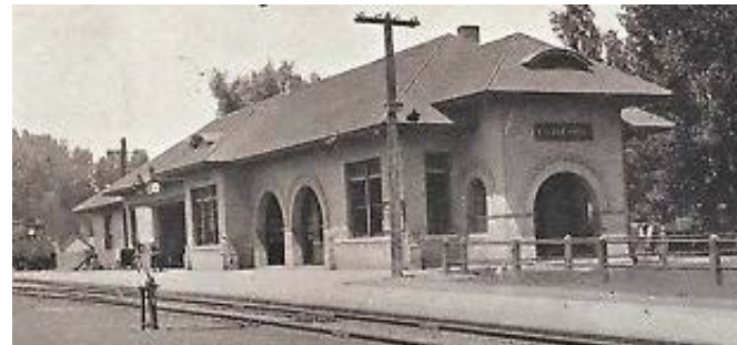
Loveland Train Depot 409 N Railroad (1902)