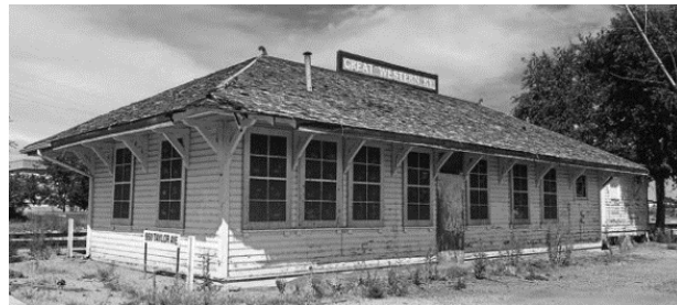
Great Western Railway Depot (1902)