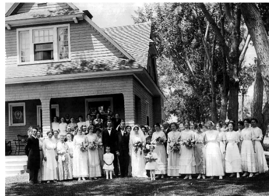
Great Western House 623 E 7 th St (1898)