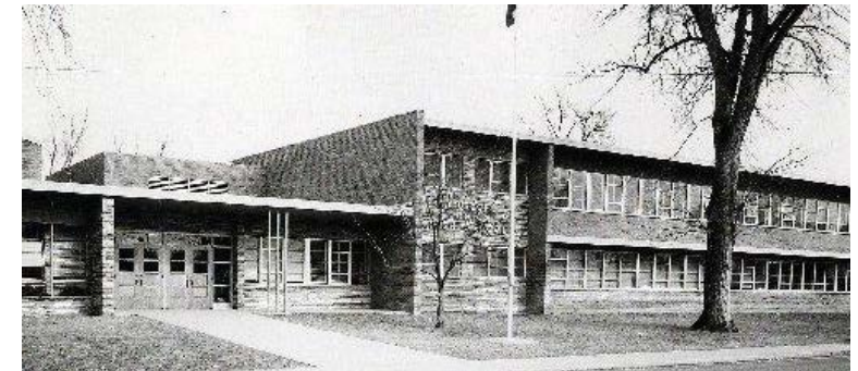
Truscott Elementary 211 W 6 th St (1957)