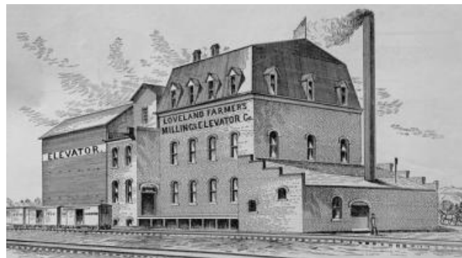
Feed & Grain Building, 130 W 3 rd St (C 1891)