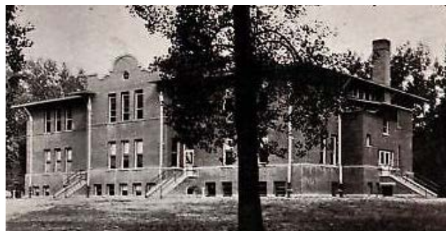
Washington School, 500 E 3 rd St (1905)