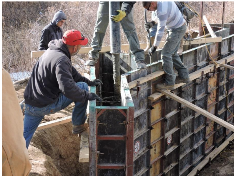
Pouring the North Bridge abutment – trail segment 10b, south of W. US 34 underpass