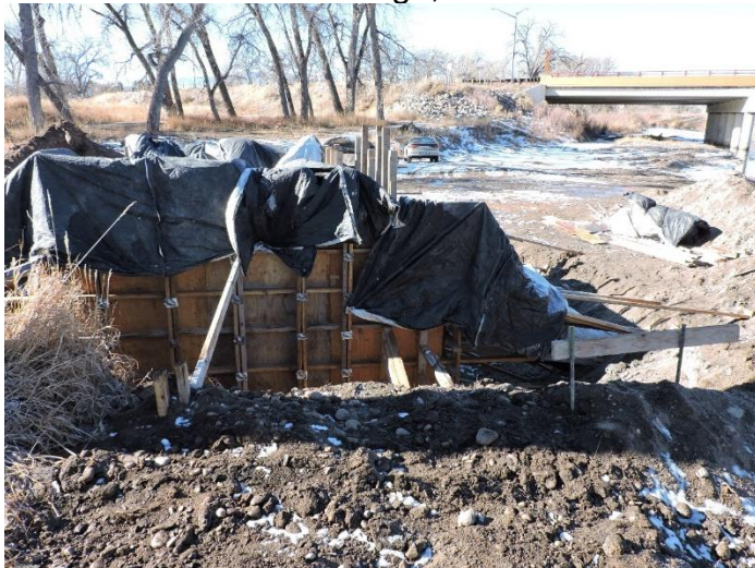
South bridge abutment – looking west towards Wilson Avenue