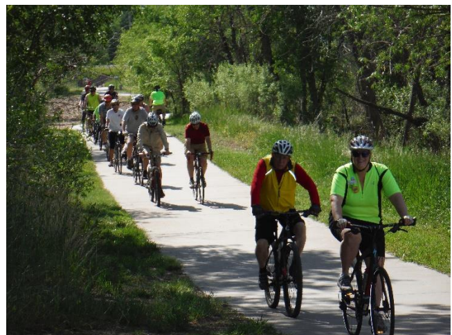
National Trails Day events on June 3

This project is complete and the trail and new bridge opened to the public in May.