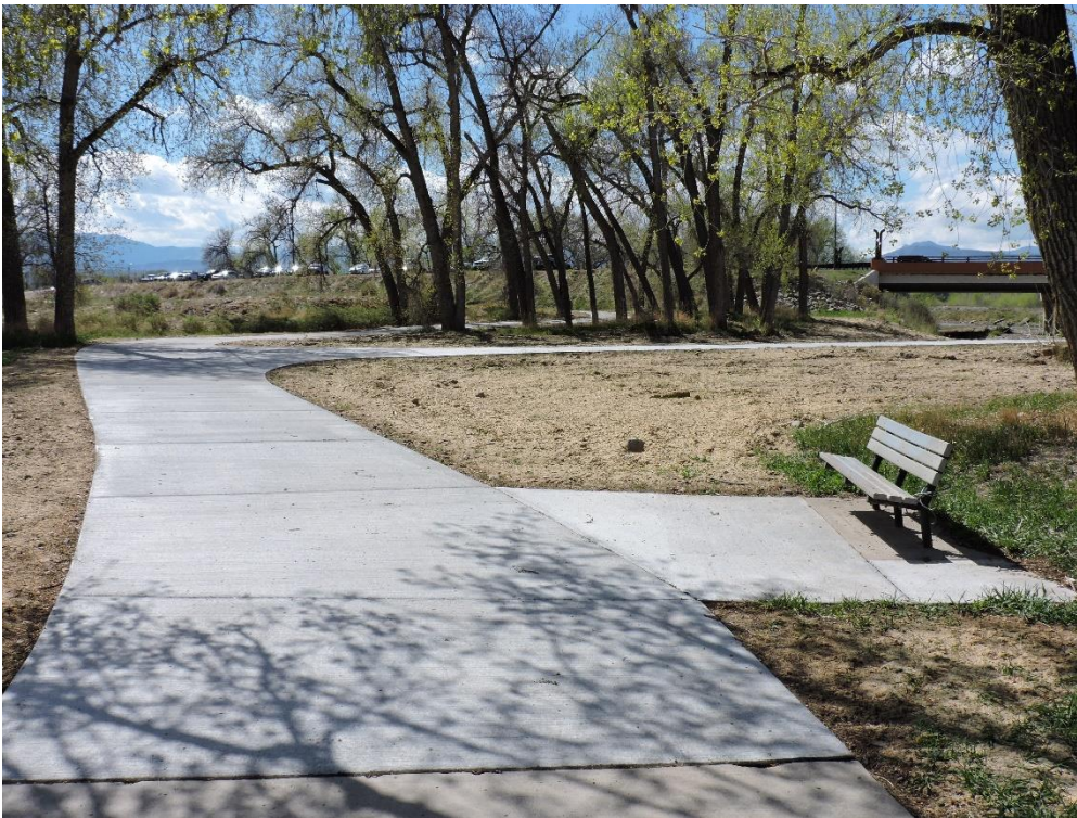
Looking west towards Wilson Avenue along new trail