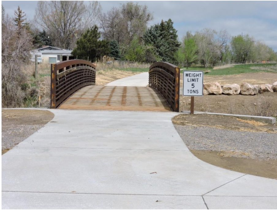
Trail segment 10b, old Viestenz-Smith Bridge over Barnes Ditch

is complete, but until the abutment railing is installed, the trail will remain closed. Staff hopes to open the trail in mid-May. A media release will be issued for the trail opening.