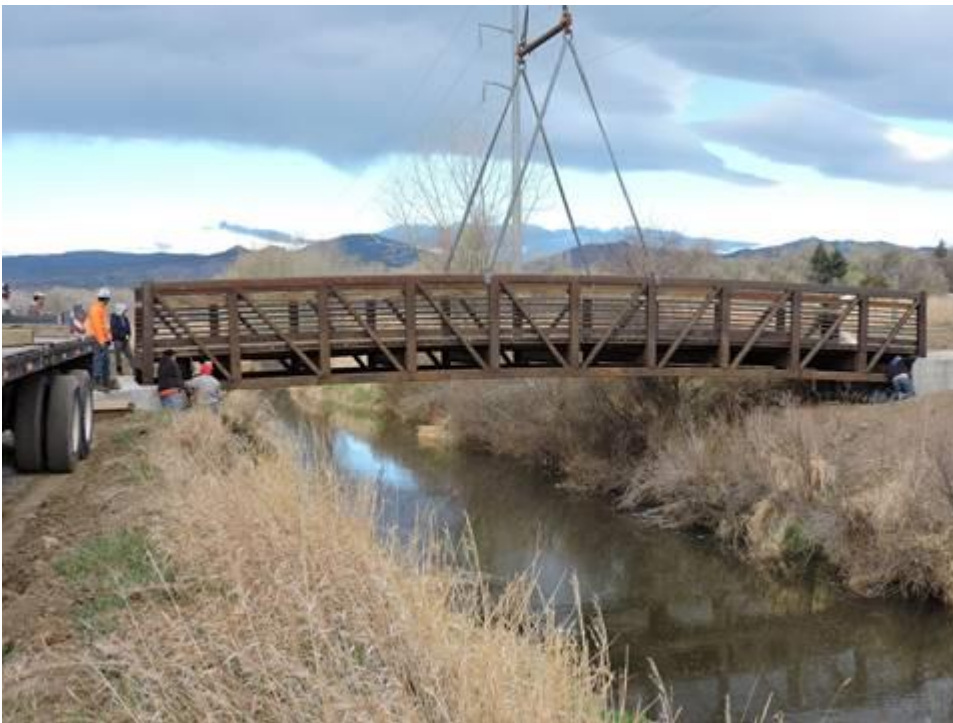
Trail Segment 10b, old Viestenz-Smith bridge being set over ditch