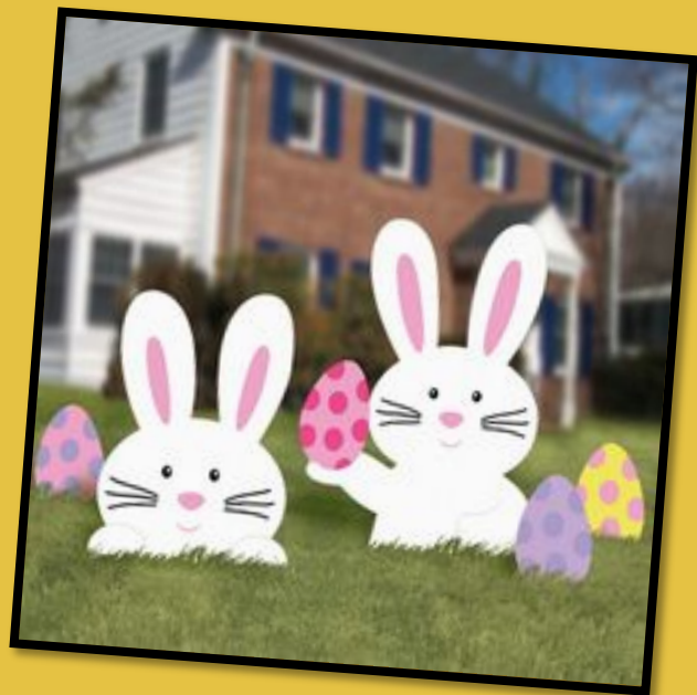
YARD DISPLAY INVITES