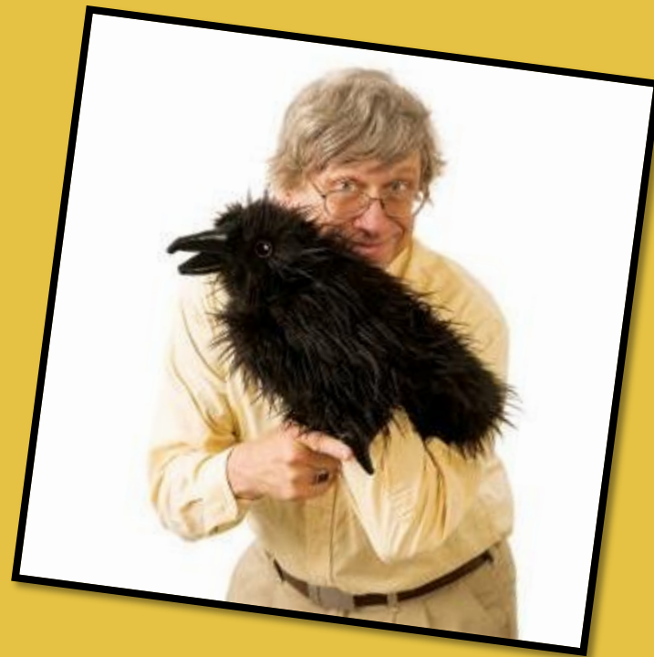
BLACK BIRD PUPPET DEMOS