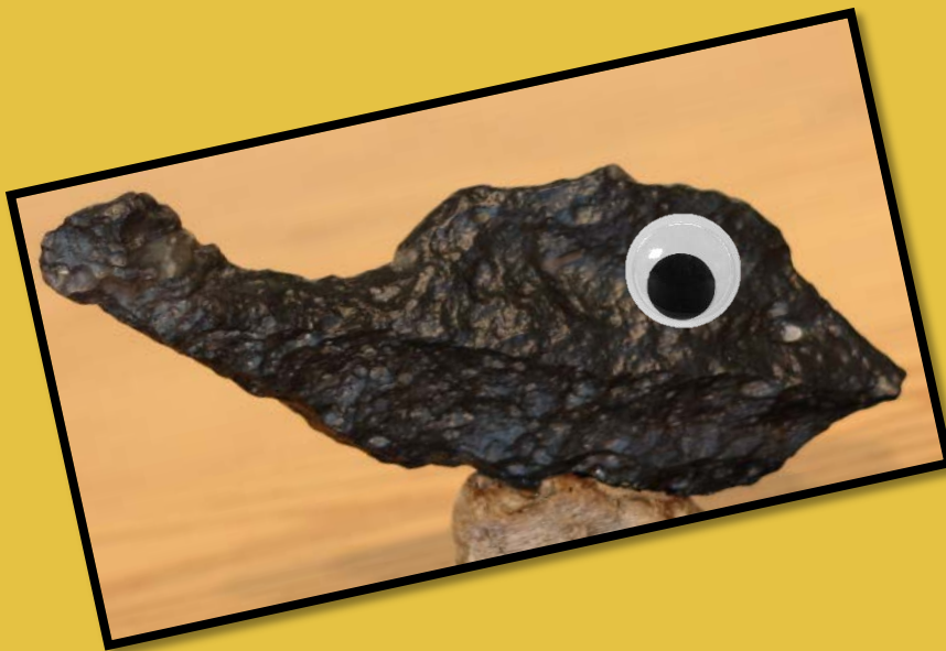
FOSSILIZED STONE FISH