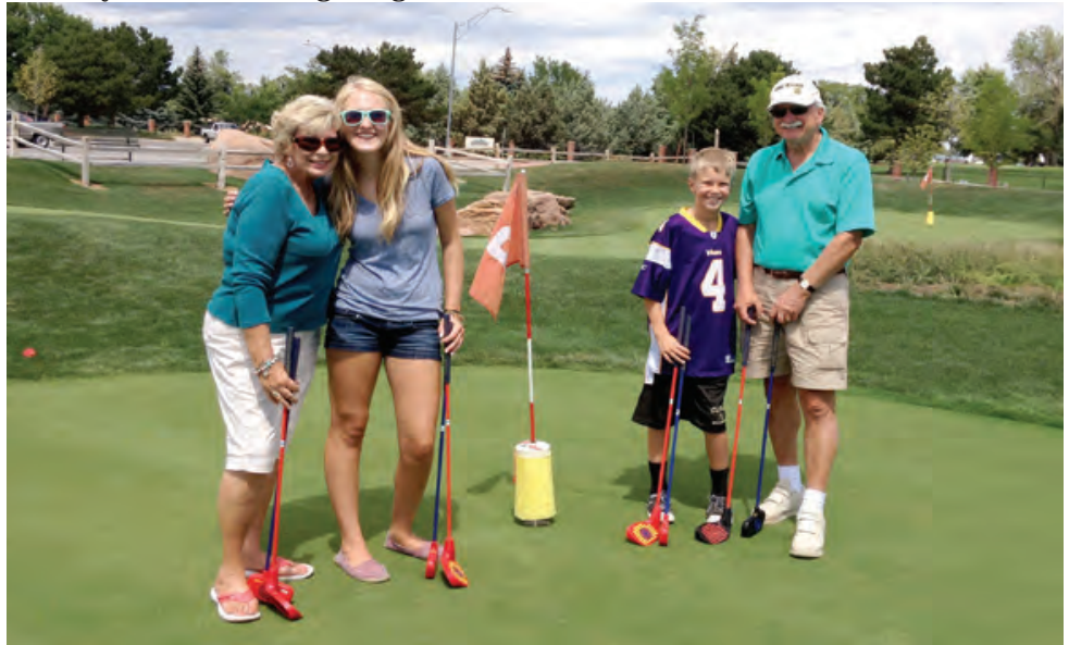
Families of all shapes, sizes and skill levels enjoy the 'Game Zone' at Cattail Creek golf course.

With ongoing mentorship by parents and grandparents, and families wanting to play golf together, this growth is expected to continue in 2016.