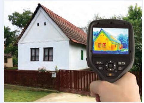
An infrared camera shows where air leaks in this home are creating energy-inefficiencies.

Get started at efficiencyworks.co or by calling (877) 981-1888.