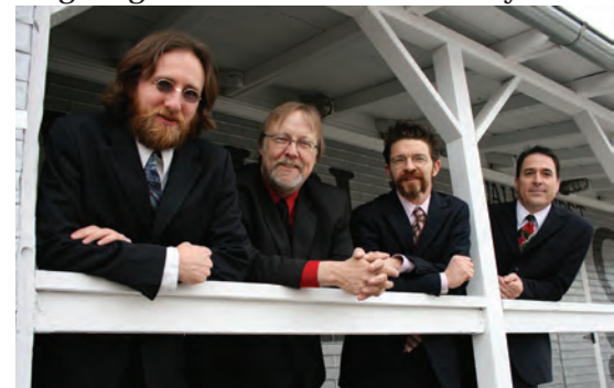
The Blue Canyon Boys will perform their 'high-octane Colorado Bluegrass' at 7 p.m. on July 28.