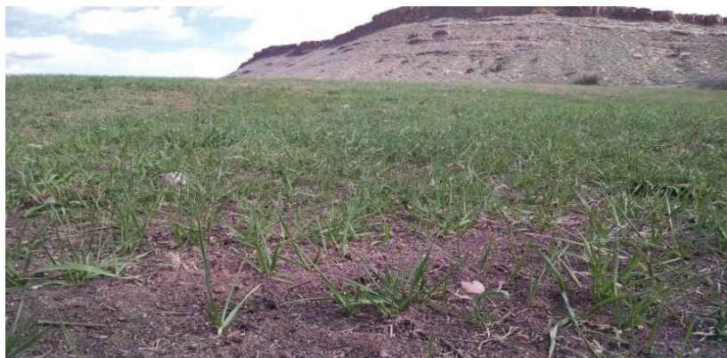
Below: New grass begins to grow in the area known as 'the Meadows' below the Loveland Water Treatment Plant as a result of the nutrient-rich residuals.

As the residuals are returned to the earth, patches of grass are sprouting along the hillside that borders the treatment plant. The Meadows will receive applications of residuals all summer which will replenish ground that has been barren and infertile. By reusing and repurposing a resource that we produce abundantly, the City is saving money and perhaps more importantly, saving our soil.