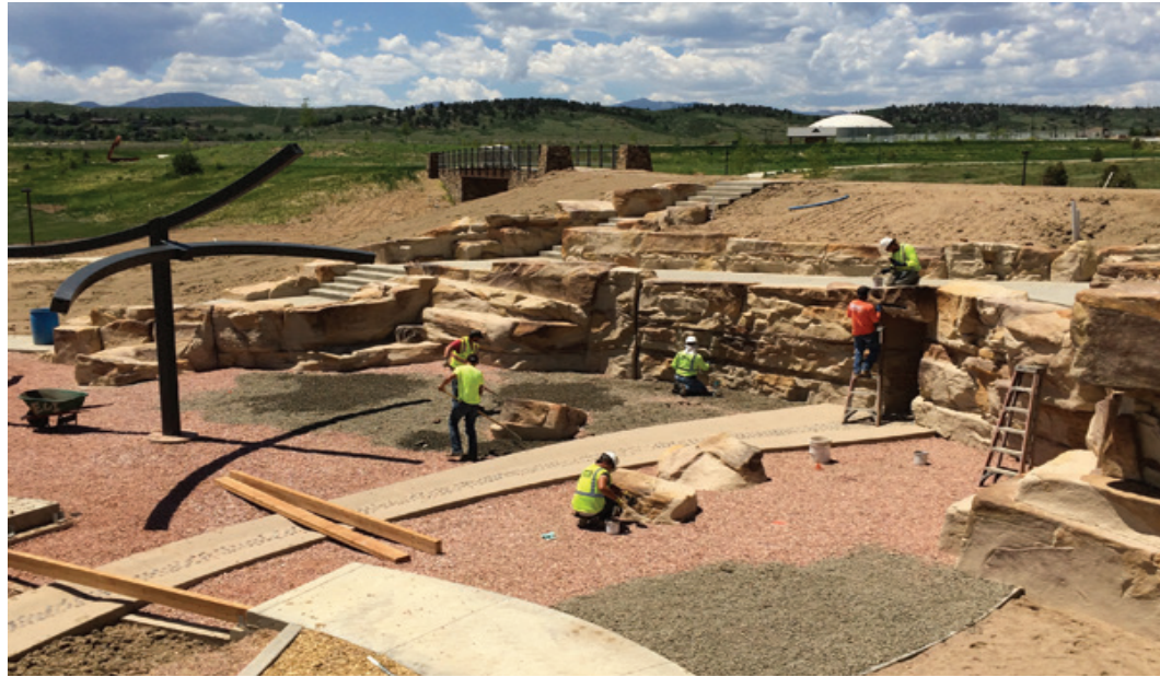
A small army of stone workers from Colorado Hardscapes Inc. swarmed over Mehaffey Park in mid-June, racing to get the play area ready for the new community park's grand opening.

Mehaffey Park's grand opening begins at 10 a.m. Aug. 1, and includes a full day of activities. City officials, residents and members of the Mehaffey family will take part in the festivities. Parking areas are accessed from 29th and 22nd streets, west of Wilson Avenue. Look for signs.