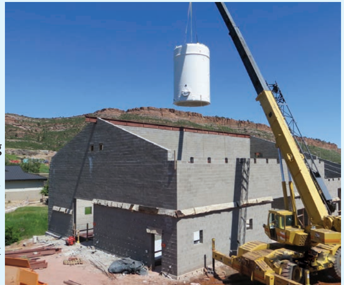
The new West Chemical building at the treatment plant will house a 22,500 gallon tank that holds the solution used water disinfection.

amendment to help re-vegetate city property damaged by the 2013 flood