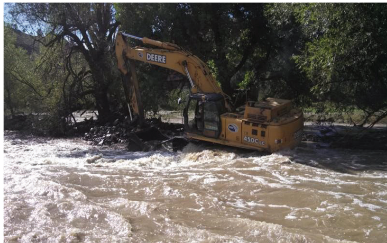
An excavator works to dig out the original river channel following the September 2013 Flood.

When the residuals are completely dry, they are applied