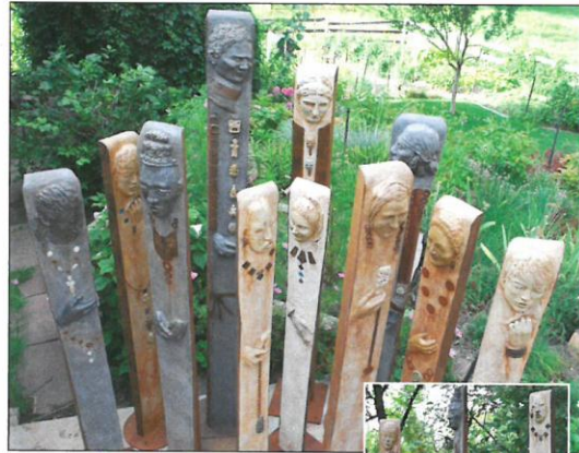
Sue Quinlan "Cultural Pedestrians"