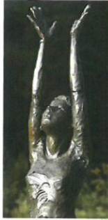
Jane DeDecker "Tree"

5. Rising Rainbow by David Turner. Description: Bronze rainbow trout. Note: Tail support will be reinforced with steel rods inside the bronze.