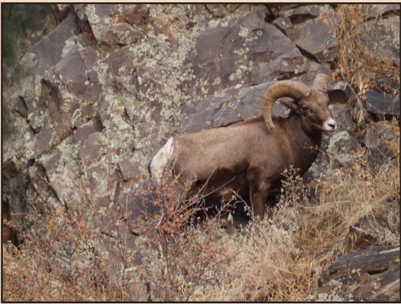
Bighorn Sheep at Viestenz-Smith Mountain Park

A new environmental education program for River's Edge Natural Area is currently under development. Potential plans include volunteer-guided and teacher-led programs with supporting materials and lesson plans available for checkout.