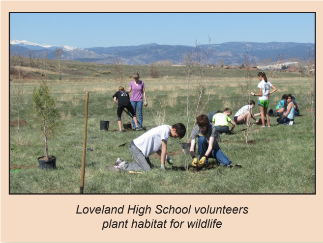
Loveland High School volunteers plant habitat for wildlife

The Open Lands Program benefited from a wide range of volunteer efforts in 2012, including Environmental Education, Trail Hosts, Exotic Species Elimination, and Native Revegetation. An enthusiastic group of Environmental Education volunteers helped teach the Wildlife Program at Viestenz-Smith Mountain Park, contributing more than 460 hours of time. Several volunteers have been with the program for more than 10 years! Open Lands Trail Host volunteers provided a valuable presence at Loveland Natural Areas, assisting and educating visitors while also reporting site conditions, usage statistics, and wildlife observations back to staff. River's Edge Natural Area will be added to the list of Trail Host volunteer opportunities offered in 2013. Numerous Front Range Community College faculty members and students removed hundreds of invasive Russian olive trees from River's Edge as part of the Exotic Species Elimination Project. Trees were tagged, mapped, cut, and treated to reduce future re-growth. The information