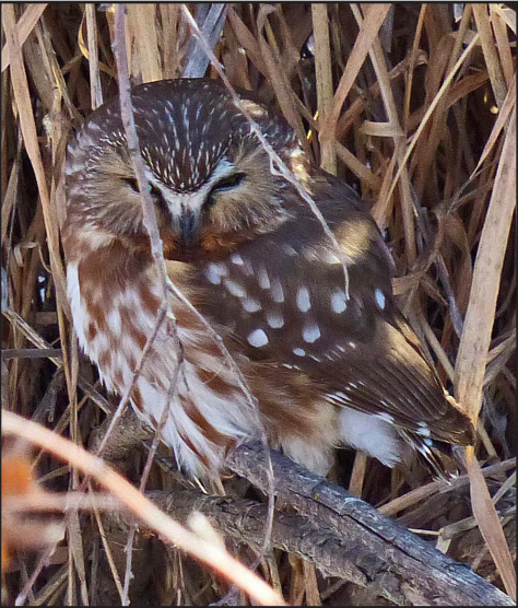
Saw-whet Owl

Our Lands – Our Future will generate a regional framework for strategic decision-making that reflects each community's priorities and needs. The study will be completed in 2013 and results will be used for integrating Loveland's Open Lands Plan into the update of the Parks & Recreation Master Plan .